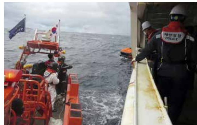
Members of South Korea coast guard conduct a search operation in waters between South Korea and Japan

The ship's captain used a satellite phone to tell the South Korean coast guard that he and the crew would abandon the sinking ship in the early hours of Wednesday morning, the