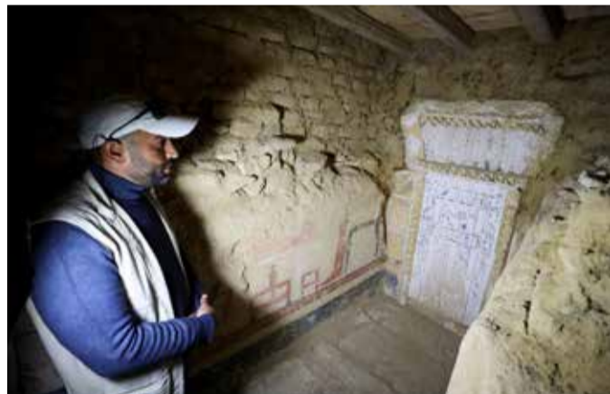
A general view inside a tomb after the announcement of the discovery of 4,300-year-old sealed tombs in Egypt's Saqqara necropolis, in Giza, Egypt

Egyptologists have uncovered a Pharaonic tomb near the capital Cairo containing what may be the oldest and "most complete" mummy yet to be discovered in the country, the excavation team leader said on Thursday.