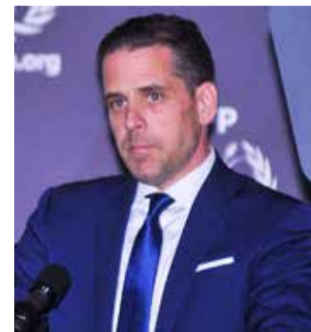
Hunter Biden painting