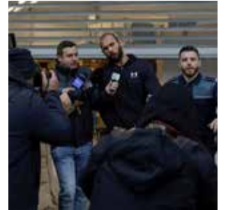
Andrew Tate answers questions from the media while being escorted by police officers