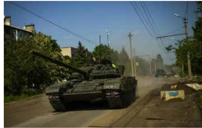
Ukrainian tanks move in Donetsk region, eastern Ukraine (file photo)

Ukrainian energy operator DTEK said it was instituting