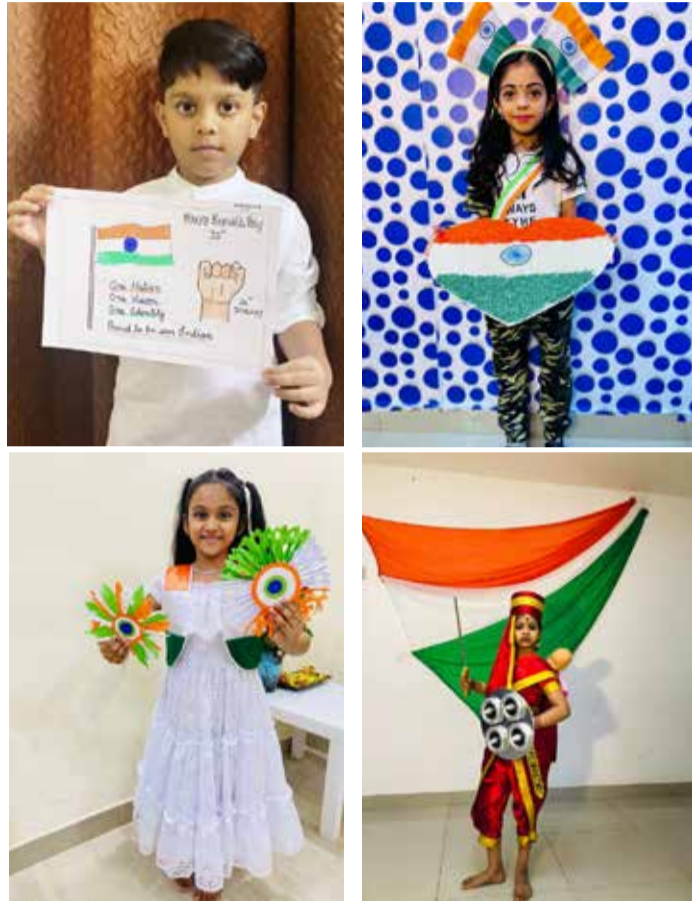
Students display their skills in various competitions

Students made sketches of their favourite leaders who led