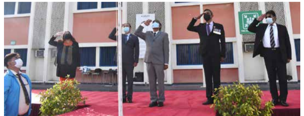
Singing of the national anthem