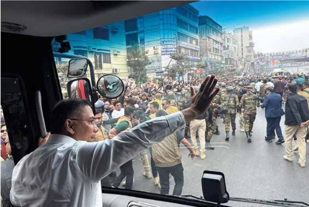
Acting chairman of the Bangladesh Nationalist Party (BNP), Tarique Rahman waving to supporters upon his arrival in Dhaka