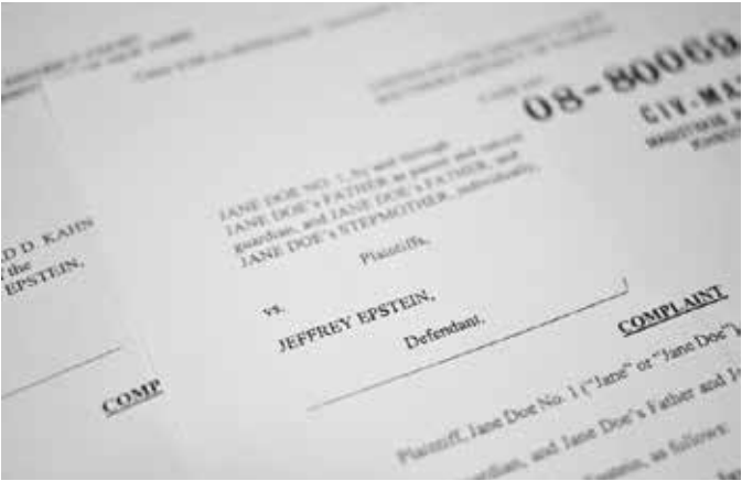
A court document from the investigation into the Jeffrey Epstein AFP | Washington

◆ The national electoral council CNE said the