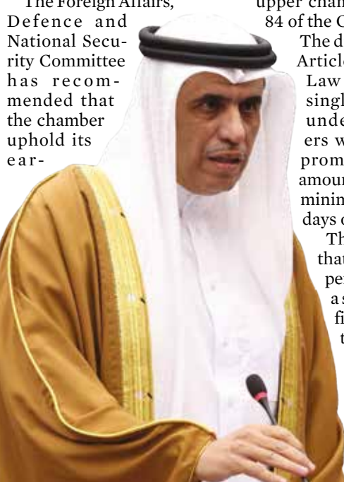
Dr Ali Al Rumaihi, Head of Shura's Foreign Affairs, Defence and National Security Committee

The Shura Council had previously rejected the draft at its April 13, 2025 session, but the elected chamber’s insistence has brought it back for reconsideration.