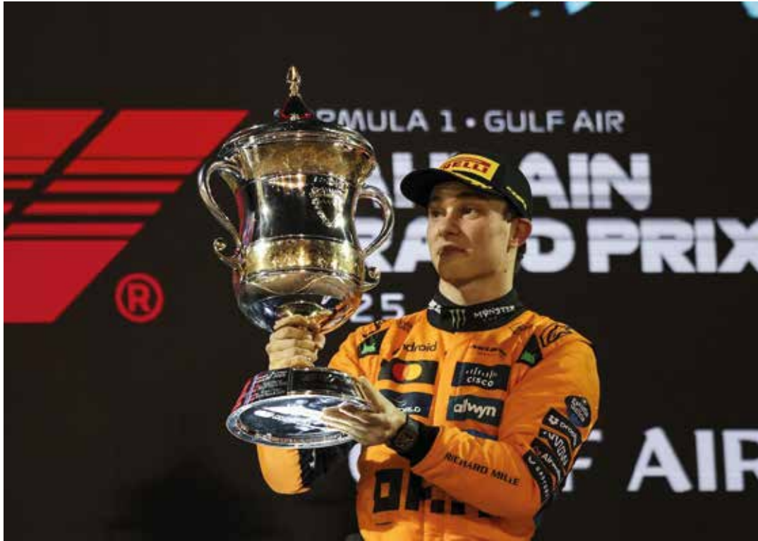
McLaren's Oscar Piastri lifts Bahrain Grand Prix trophy

From lifting the Arabian Gulf Cup in January to record medal success in Riyadh and hosting the Asian Youth Games in October, 2025 was a year of triumph, ambition, and national pride. Bahrain did not simply host sport—it excelled in it, invested in it, and inspired through it. As the final whistle blew on a remarkable year, one message was clear: Bahrain shaped sport in 2025, and its legacy is only just beginning.