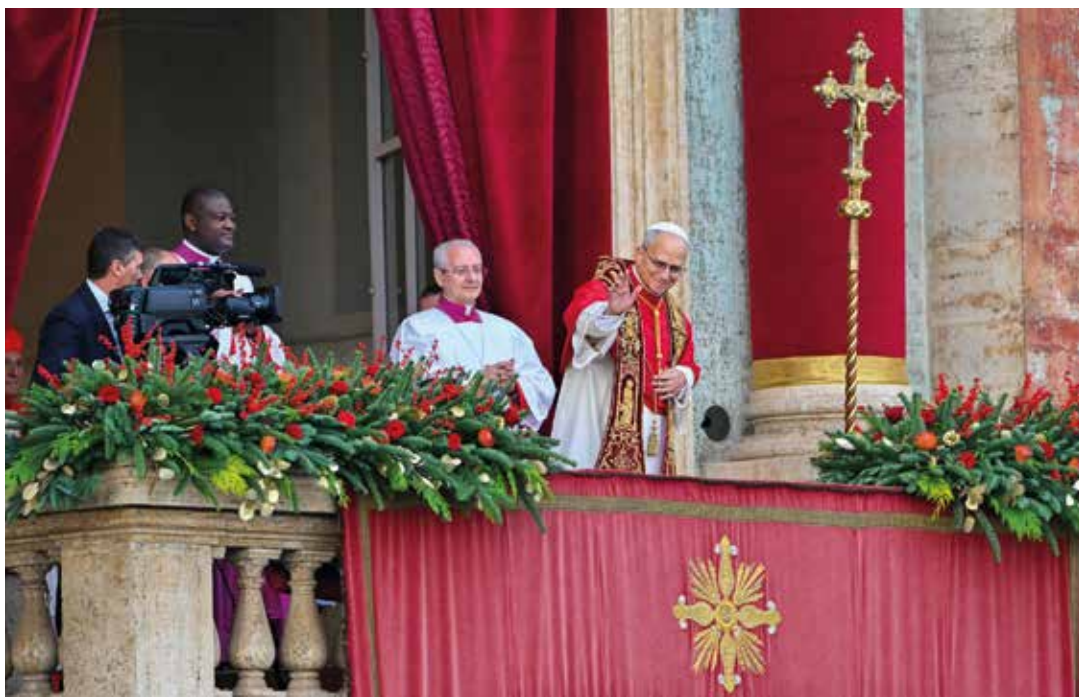
Pope Leo XIV waves to the faithful at the main balcony of St. Peter's basilica

Tens of thousands have been killed, eastern Ukraine decimated and millions forced to flee