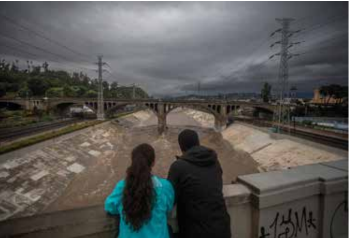
A couple watches the high water level of the Los Angeles river after heavy rains

Torrential rains unleashed flash floods and warnings of debris flow across southern California, particularly in fire-scarred areas, with further downpours forecast for later yesterday as authorities declared a state of emergency in several counties. Driven by an atmospheric river known as "the Pineapple Express," which moves heavy moisture from the tropical climes of Hawaii to the US West Coast, the storm was expected to deliver months' worth of rain over a few days. Early yesterday, the National Weather Service (NWS) warned about the risk of excessive rainfall over parts of southern California, including in Los Angeles, the second-most populous city in the United States. The NWS warned of a "broad plume of moisture" producing heavy rain in California on Christmas Day, adding there was a "moderate risk" of excessive