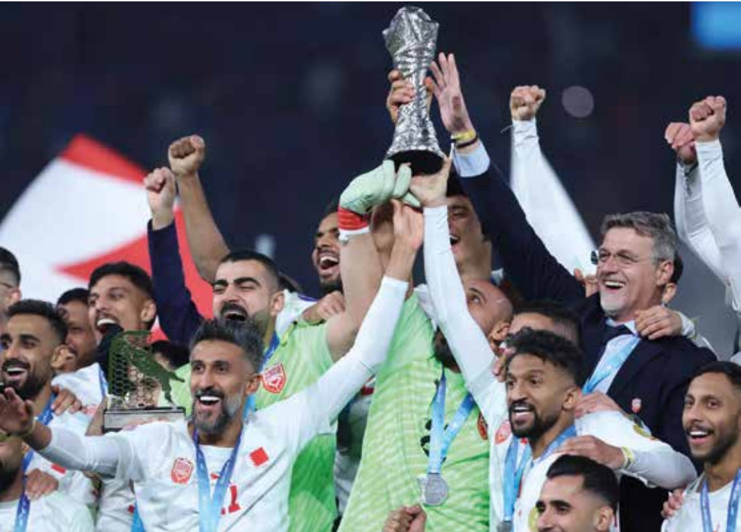
Bahrain opens 2025 with Gulf Cup victory

By April, the roar of engines took over. The Bahrain Grand Prix, held at the Bahrain International Circuit—a staple on the F1 calendar since 2004—delivered drama under the desert lights. McLaren's Oscar Piastri claimed victory, with George Russell second and Lando Norris third. His Royal Highness Prince Salman bin Hamad Al Khalifa presented the trophy, praising McLaren's performance as a reflection of Team Bahrain's dedication. McLaren later secured the Formula 1 World Drivers' Championship, completing a historic double and cementing Bahrain's reputation as a hub for elite motorsport.