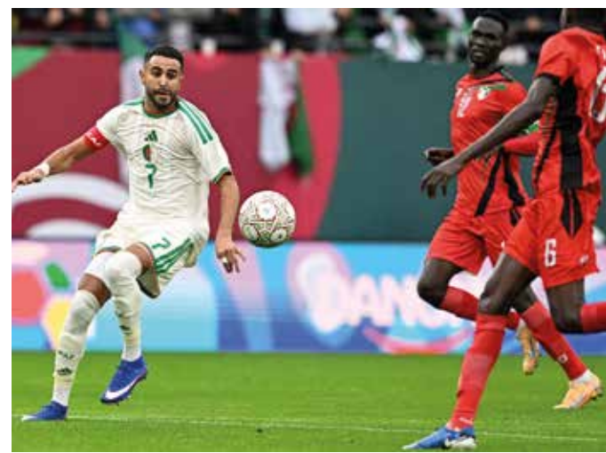
Algeria's forward #7 Riyad Mahrez (L) controls the ball