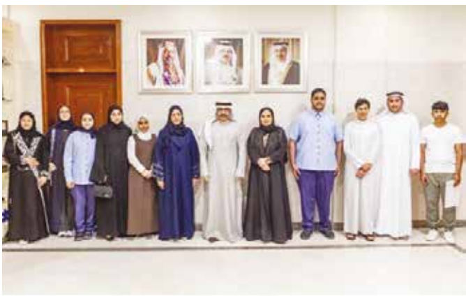
Dr. Mohammed bin Mubarak Juma, Minister of Education, received nine students from schools in the Kingdom of Bahrain who won top positions in the Latifa bint Mohammed Award for Childhood Creativity, held in the United Arab Emirates.

If fully implemented, the 17 SDGs could lift over 1 billion people out of poverty and help protect the planet by 2030.