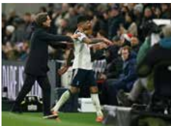
Cristian Romero is ushered off the pitch by coach Thomas Frank

Cristian Romero could be hit with an extended suspension after he was charged by England's ruling Football Association with failing to leave the field and acting in an "aggressive" manner when he was sent off against Liverpool last Saturday.