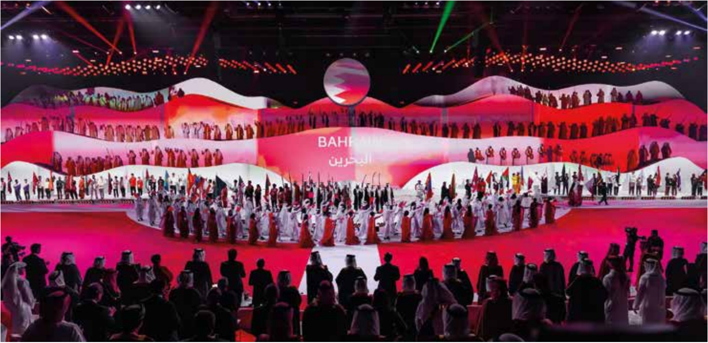
Opening ceremony of 3rd Asian Youth Games in Bahrain

Sport in Bahrain is about more than elite competition. Bahrain Sports Day, held on 17 February,