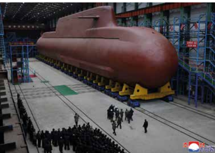
North Korean leader Kim Jong Un visiting the manufacturing site of an 8,700-tonnage nuclear-powered strategic guided missile submarine

Their work demonstrated the nations' "militant fraternity", Pu-