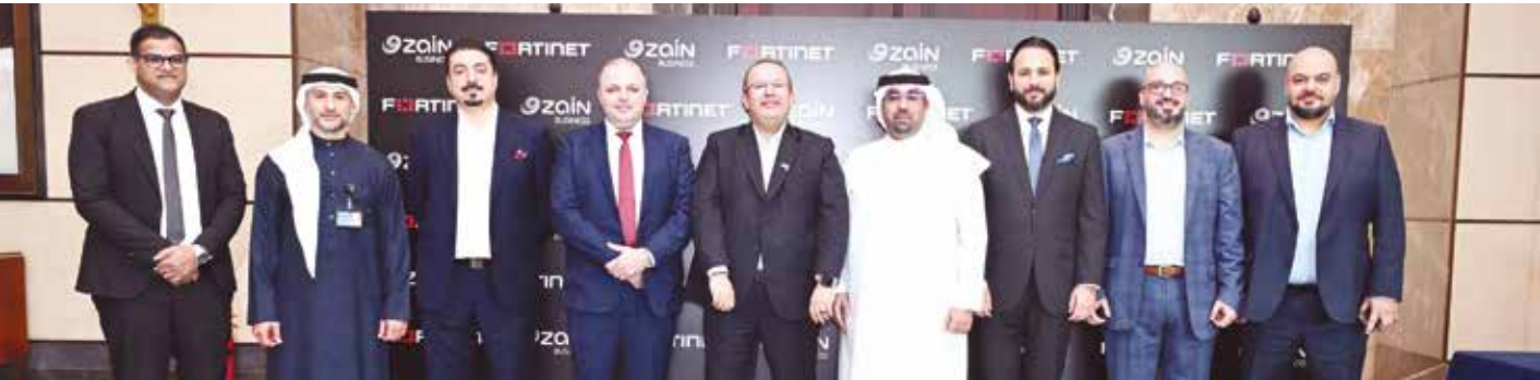
Zain Business, in partnership with Fortinet, hosted an expert-driven workshop on Securing Your Enterprise with Fortinet Cloud Security. The event connected clients with leading experts from both Zain and Fortinet to deep dive into cutting-edge cloud protection, security enhancements, and automation capabilities.