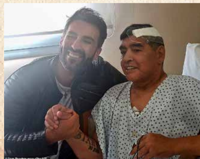
LAST PICTURE- Maradona's death comes just three weeks after he underwent surgery on a blood clot in his brain (pictured), and less than a month after he turned 60