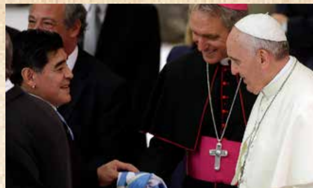
Maradona, left, greets Pope Francis in the Paul VI hall at the Vatican, ahead of an inter-religious match for peace in September 2014