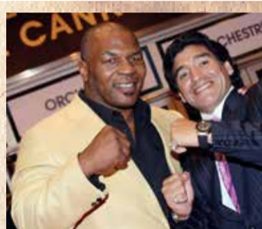
Former US boxing champion Mike Tyson (L) and Diego Maradona after arriving to attend the 61st Cannes International Film Festival on May 21, 2008 in Cannes

back to the final even though they won just two games and scored only five goals.