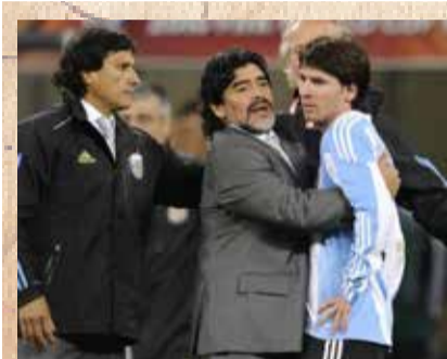
Argentina's coach Diego Maradona hugs Argentina's striker Lionel Messi after the 2010 World Cup quarter final Argentina vs Germany