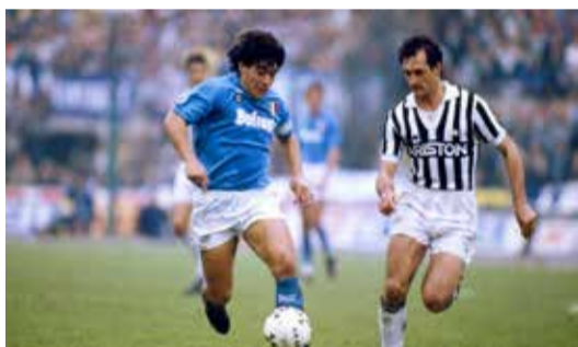
Maradona goes up against Juventus's Luigi De Agostini during his time at Napoli. The Argentinian led the club to two Serie A titles as well as the UEFA Cup

He wound down his playing career with one