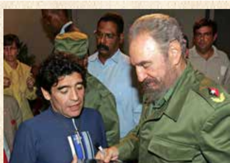
Diego Armando Maradona (L) talks to Cuban President Fidel Castro, before recording Maradona's TV program 'The 10's Night' in Havana 27 October 2005