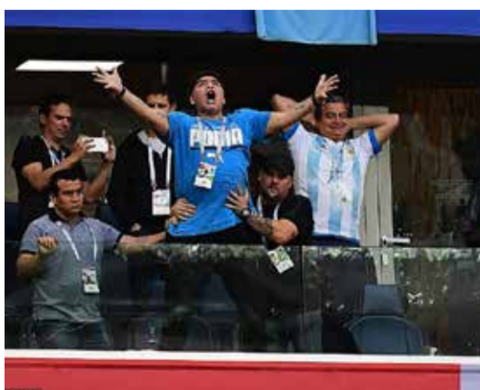
Maradona pictured at the 2018 World Cup, where he watched Argentina from executive boxes