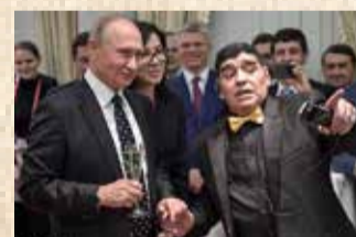
Russia's President Vladimir Putin talks to Argentinian retired striker Diego Maradona (L-R) ahead of the 2018 FIFA World Cup final draw at the State Kremlin Palace