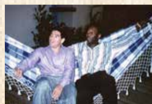
Soccer legends Diego Maradona (left) and Pele rest on a hammock during a reception in Rio de Janeiro, May 14, 1995