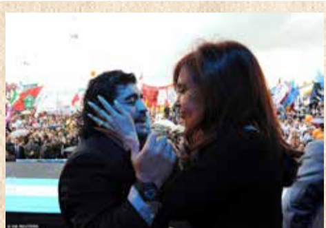
Argentina's President Cristina Fernandez de Kirchner (right) embraces former Argentine soccer star Diego Maradona during a rally in Buenos Aires