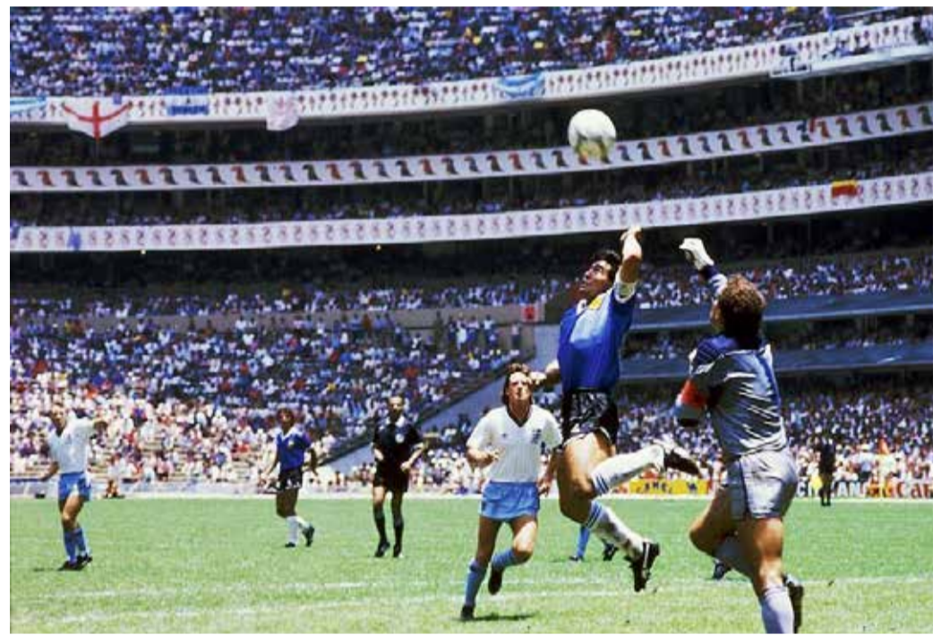
Maradona's Hand of God was responsible for England's elimination from the 1986 World Cup

Diego Armando Maradona was born on October 30, 1960, in Lanus, just outside Buenos Aires, and grew up in one of the poorest areas of the Argentine capital.