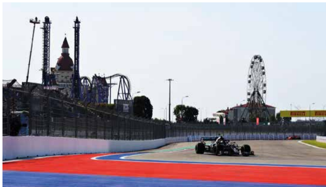
Valtteri Bottas steers his car during practice

In front of a meagre scattering of fans to witness practice, with 30,000 due to attend Sunday's