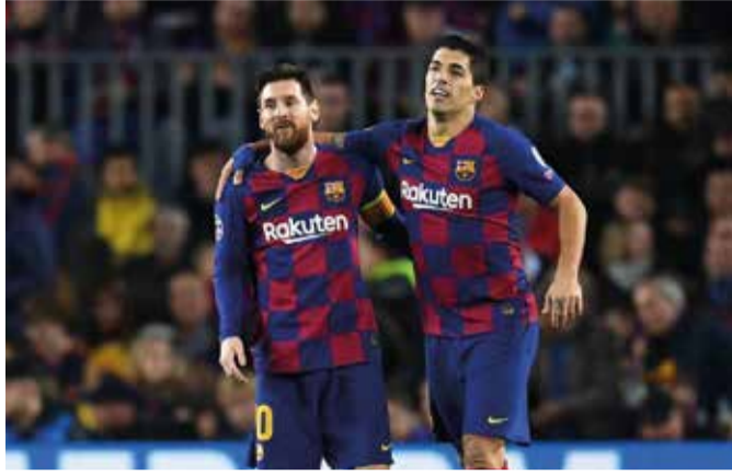
Lionel Messi (L) and Luis Suarez during a match (file photo)