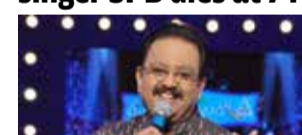
SP Balasubrahmanyam | Chennai

Renowned Indian singer SP Balasubrahmanyam, a Guinness world record holder for his more than 40,000 songs over 50 years, has died aged 74.