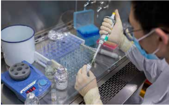
A technician works in a lab in China producing potential COVID-19 vaccine

Hundreds of thousands essential workers and other limited groups of people considered at high risk of infection have been given the vaccine, even though its efficacy and safety had not been fully established