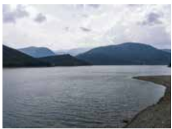
The lake at Serbia and Kosovo’s border

The lake in question is a 24-kilometre (15-mile) stretch