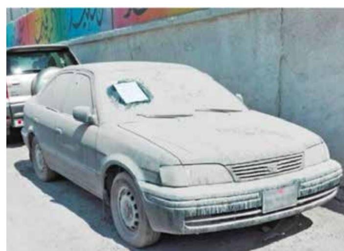
Representative picture showing an abandoned car on a street

When it comes to Cleaning services Department, the Un-