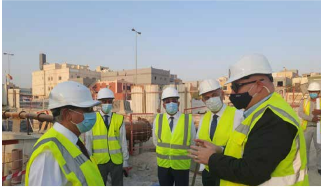
The minister during a visit to the project site.

When completed, Shaikh Zayed Highway will have a capacity to accommodate 53,000 vehicles per day in two directions