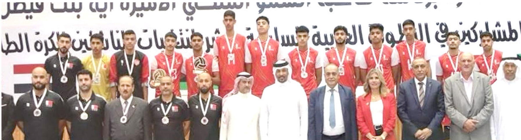
Team Bahrain receive their silver medals

Bahrain's under-18 men's volleyball team finished runners-up at the 17th Arab Junior Volleyball Championship in Amman after a dramatic 2-3 defeat to Egypt in last