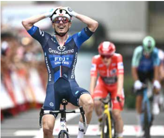
Team Groupama-FDJ's French rider David Gaudu celebrates winning the third stage