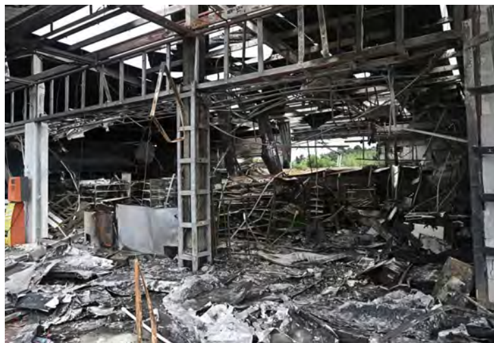
Damage from a fire caused by Cambodian artillery at a 7-11 convenience store is seen at a PTT gas station in the Thai border province of Sisaket

A steady thump of artillery strikes could be heard from the Cambodian side of the border yesterday, where the province