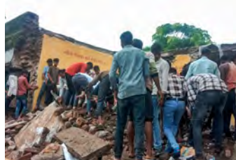
People gather to remove debris at the site of collapse