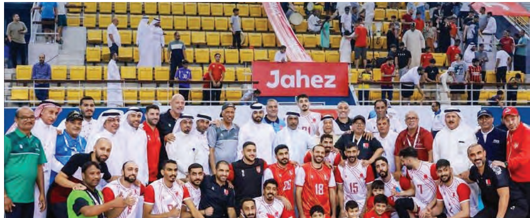
Bahrain's squad celebrate after the final whistle

initiative, celebrating at the non-striker’s end as Root reached 13,379 runs with a single behind point, moving one ahead of Ponting’s figure. “Congratulations, Joe Root. Magnificent, second on the table,” Ponting said on Sky Sports. England earlier resumed on 225-2 following a blistering opening partnership of 166 in 32 overs between Zak Crawley and Ben Duckett on day two, with Pope 20 not out and Root on 11. India’s pacemen had too often been wayward on Thursday and Jasprit Bumrah saw his first ball yesterday drift down the legside to be clipped away for four by Root in elegant fashion. Root then uppercut Mohammed Siraj over the slips for another boundary. On 21, the former England skipper walked a long way across his stumps only to miss an intended glance off Siraj.