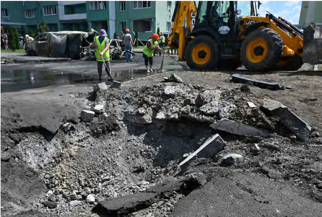
Communal workers clear debris near a crater at the site, following an aerial attack in Kharkiv

The timing would roughly align with a deadline set by Trump, who earlier this month gave Russia 50 days to strike a peace deal with Ukraine or face