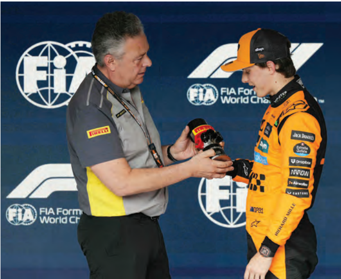
Director of Pirelli Mario Isola gives McLaren's Australian driver Oscar Piastri the pole position award

Pierre Gasly was eighth for Alpine ahead of Racing Bulls' rookie Isack Hadjar and Sauber's Gabriel Bortoleto while seven-time champion Lewis Hamilton wound up in 18th place after spinning his Ferrari in SQ1.