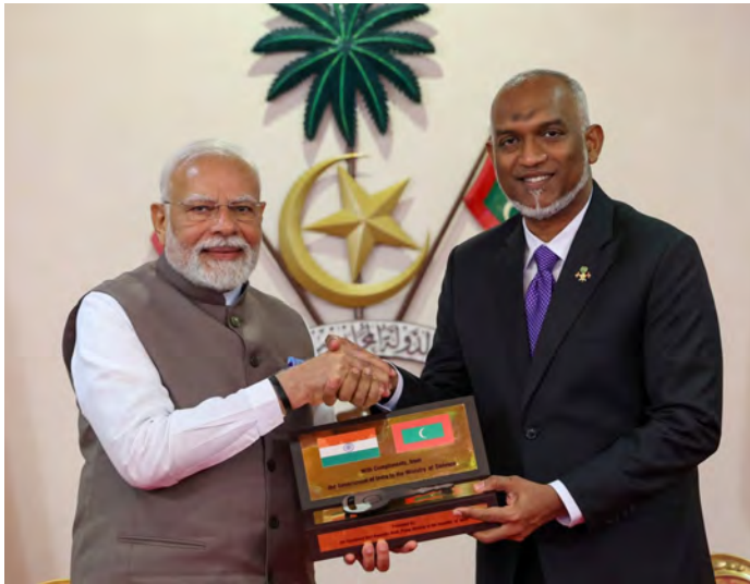
President of Maldives Mohamed Muizzu (R) and India's Prime Minister Narendra Modi posing ahead of exchanging a Memorandum of Understanding

He also inaugurated several infrastructure projects, in-