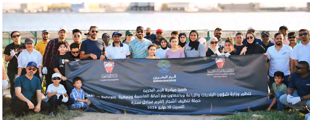
The Ministry of Municipalities Affairs and Agriculture, in cooperation with Clean Up Bahrain, organized a campaign to clean up mangrove planting sites in Umm Al-Beidh, Sitra, on the occasion of the International Day for the Conservation of Mangrove Ecosystems. The campaign was attended by a number of ministry employees, volunteers from the association, and more than 100 volunteers from various segments of society.