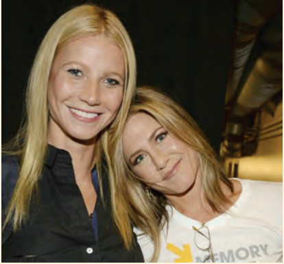
Gwyneth Paltrow and Jennifer Aniston

Gwyneth Paltrow is said to have admitted to being consumed with sadness when she learned Brad Pitt had married Jennifer Aniston. The 52-year-old actress’ relationship with Brad, 61, began in 1994 after they met on the set of Se7en and Despite their engagement in 1996, they ended their relationship in 1997 without ever giving a concrete reason for the split. According to writer Amy Odell’s new book Gwyneth: The Biography, the actress told a reporter during a