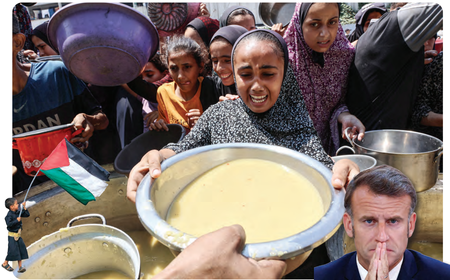
A displaced Palestinian girl reacts as she receives lentil soup at a food distribution point in Gaza City in the northern Gaza Strip

Paris backs recognition of Palestinian state as Gulf countries welcome move