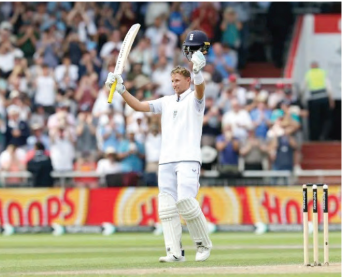
England’s Joe Root celebrates his century | Manchester

Joe Root climbed to second on the all-time list of Test run-scorers after hitting a sparkling 38th century yesterday as England hunted a series-clinching win against India. Ben Stokes’ men, 2-1 up in the five-match series, were 433-4 at tea on the third day of the fourth Test at Old Trafford, 75 runs ahead of the toiling tourists. The imperious Root, who had just overtaken retired Australia great Ricky Ponting in the run-scoring charts, was 121 not out, with Stokes unbeaten on 36. Earlier, Ollie Pope (71) put on 144 for the third wicket with Root before he was dismissed by Washington Sundar, who also removed Harry Brook cheaply to give India renewed hope. But skipper Stokes ensured England regained the