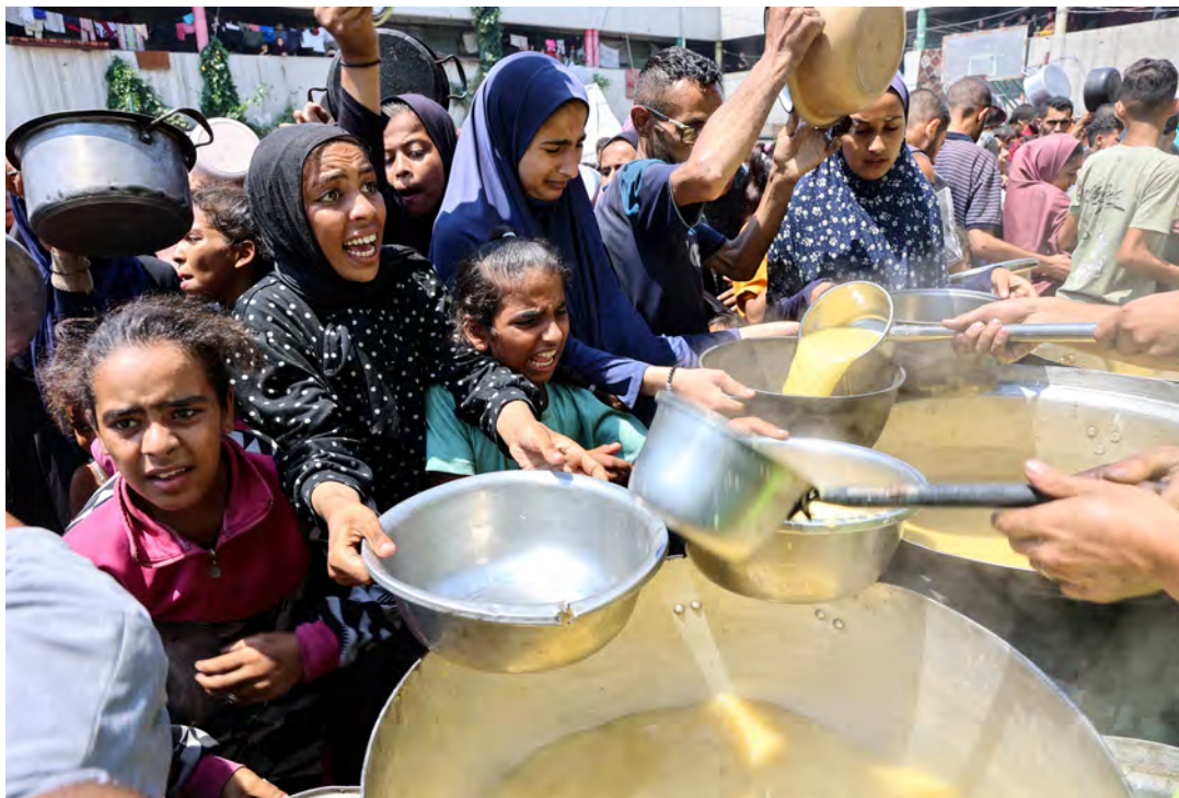
Displaced Palestinians receive lentil soup at a food distribution point in Gaza City in the northern Gaza Strip

Witkoff's "negative statements... run completely counter to the context in which the last