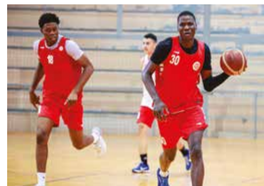
Bahrain's frontcourt duo Onoduanyi (L) and Abdulkadir (R) in a training session

Bahrain open their campaign against Algeria tomorrow at 3:15pm, before facing hosts Tunisia on Sunday at 5:30pm. They then meet Libya on Monday at 1pm, followed by a rest day on Tuesday. The team will resume action against Morocco on Wednesday at 1pm, before