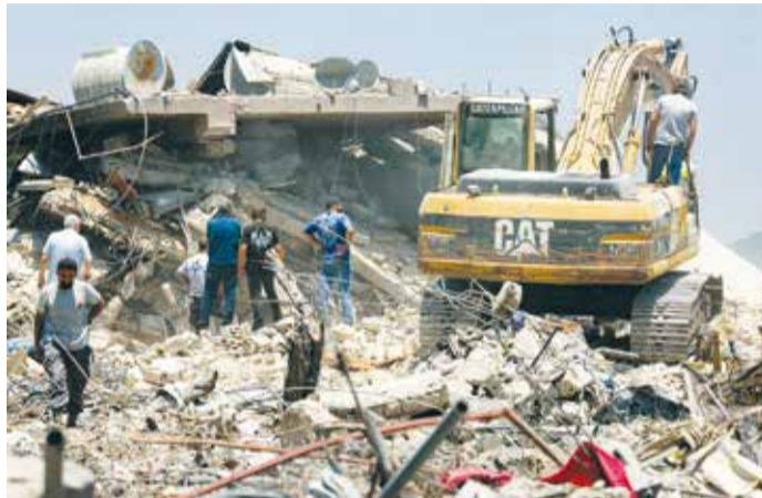
An excavator clears rubble from the site of a collapsed building, following Israeli bombardment in Nabatieh in southern Lebanon

"We will not withdraw our forces from southern Lebanon as long as Hezbollah remains a threat, are not disarmed and