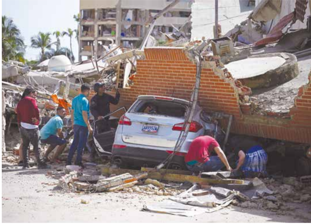
People search through the rubble around a car trapped beneath the collapsed remains of a residential building following an earthquake in Catia La Mar, La Guaira state, about 30 km northwest of Caracas

● United States Geological Survey said magnitude 7.2 and 7.5 quake hit northern Venezuela within a minute of each other.