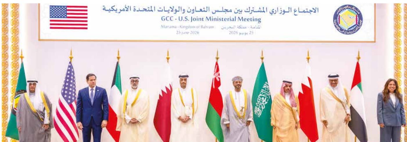
Attendees of the joint ministerial meeting

In a defining moment for Gulf-American diplomacy, foreign ministers of the Gulf Cooperation Council convened with United States Secretary of State Marco Rubio in a high-level joint ministerial meeting, co-chaired by Bahrain's Foreign Minister Dr. Abdullatif bin Rashid Al Zayani on behalf of the GCC in Manama.