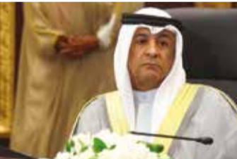
GCC Secretary General Jassem Mohamed Albudaiwi attended the landmark session.

Rubio described recent events as a significant test of the Gulf-American alliance — one the partnership passed. "The