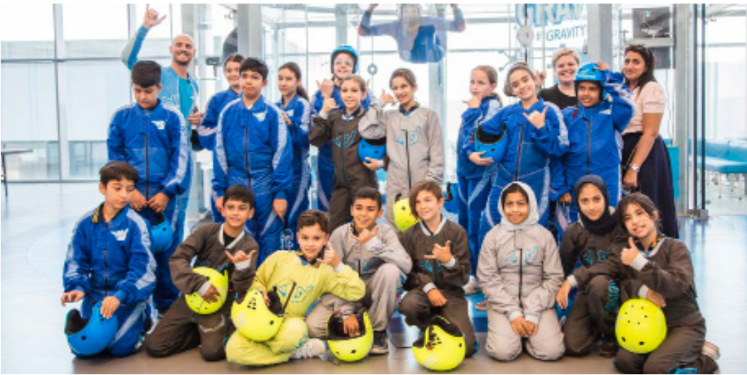
Capital School students during their visit to Gravity

STEM is Science, Technology, Engineering and Math and Gravity's STEM programme is designed to show students how science and technology are relevant to our lives and encourage them to build interest in these subjects and careers.