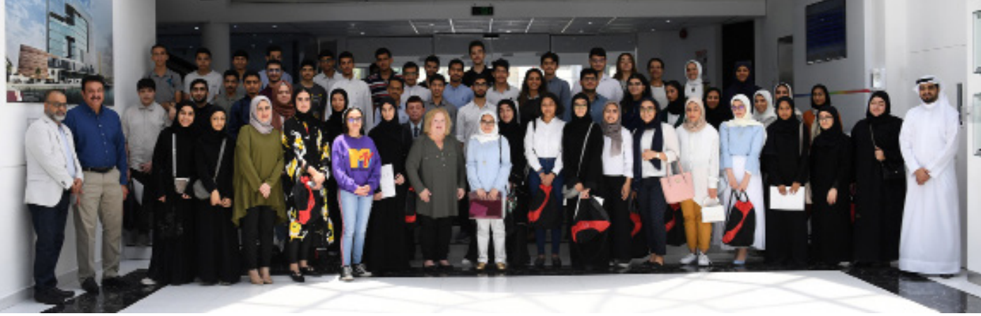
The pre-selected students who reached the final stage of the Candidacy Programme selection process during an induction session