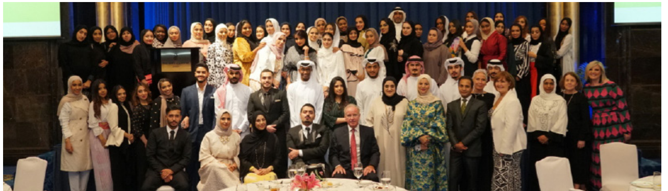
Graduating class of RCSI Bahrain's School of Nursing and Midwifery

A number of academic and extracurricular awards were presented during the events, including medals for academic performances over course of their studies, as well as prizes for distinguished interns and clinical tutors.