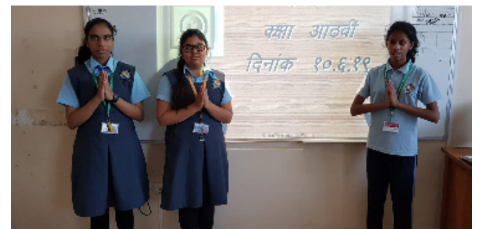
Students take part in activities during the language week