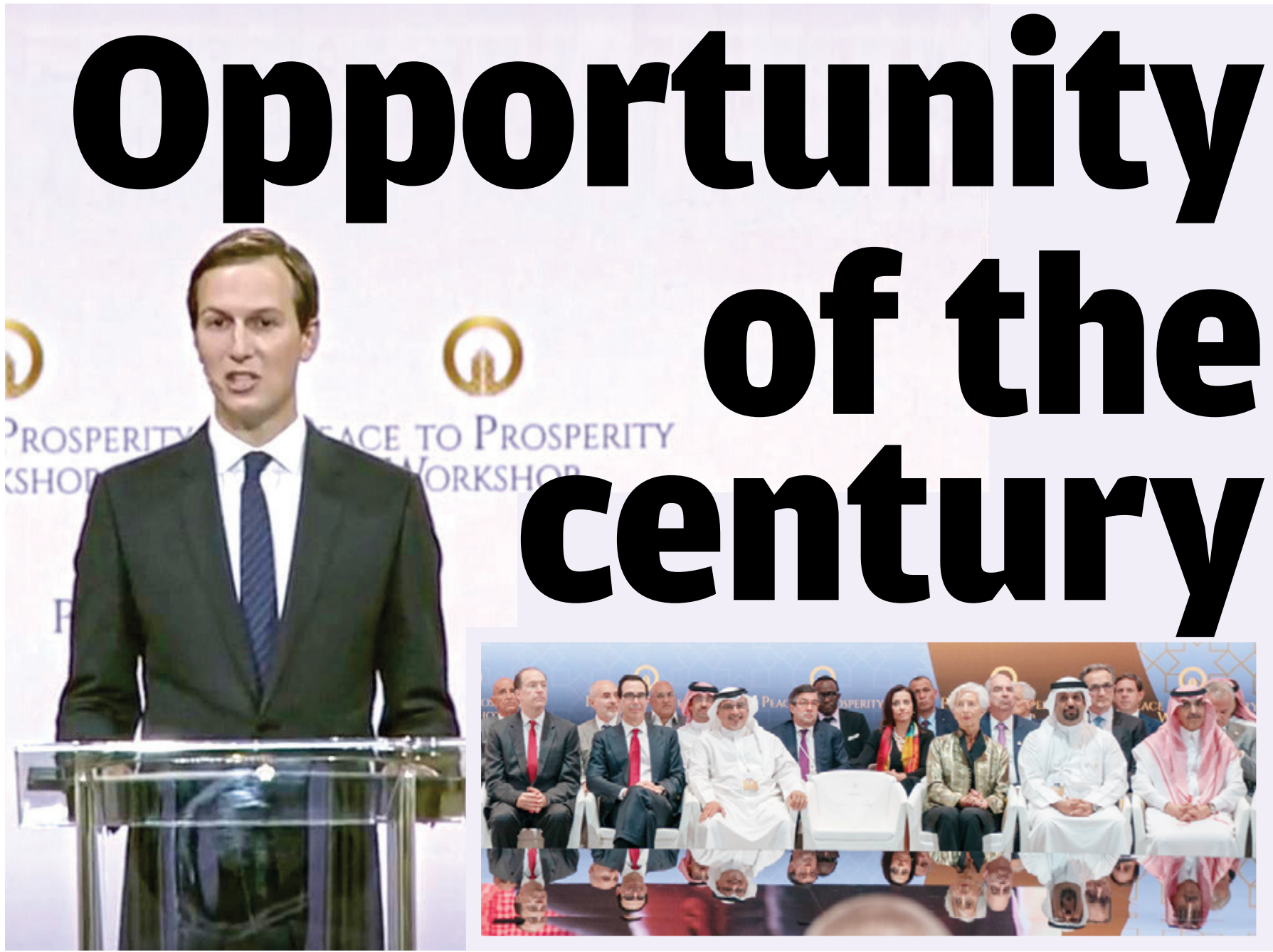
Mr Kushner details the plan at the workshop attended by HRH the Crown Prince and other dignitaries.

● Mr Kushner said that the new plan could help double Palestine's GDP and create a million new jobs, cutting down poverty.