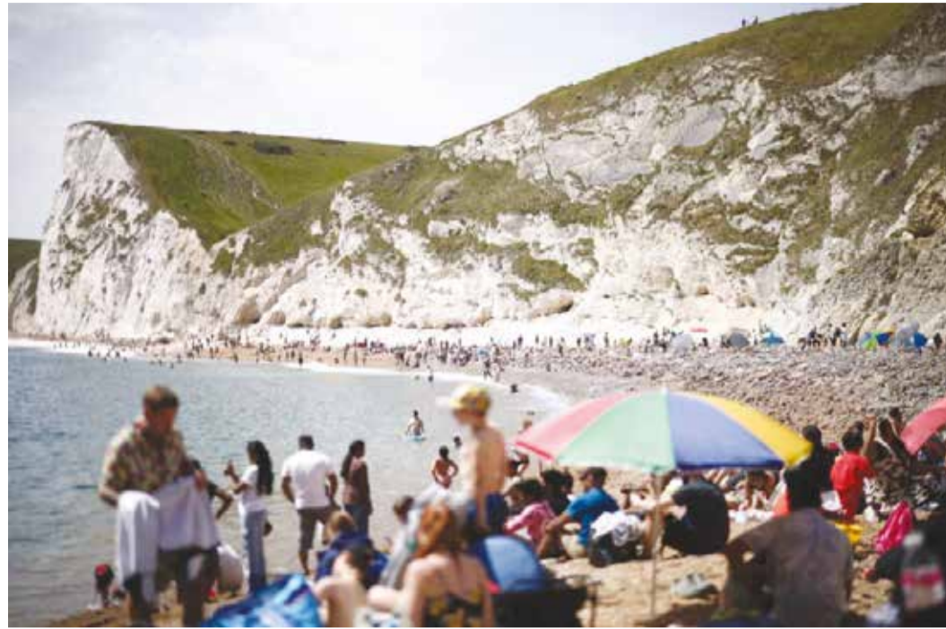
People relax in the sunshine on Durdle Door beach, east of Weymouth on the south coast of England

The Met Office weather agency said Monday was the hottest May day on record, with the mercury rising to 33.5C at Heathrow, west of the capital, at 1:00 pm (1200 GMT) -- 1.3C more than the previous benchmark