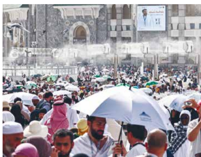
Worshippers walk along the Grand Mosque complex under the water-mist fans installed in the holy city of Mecca, ahead of the annual Hajj pilgrimage

bours. Despite the uncertainty triggered by the conflict, Saudi officials noted over the weekend that more pilgrims had travelled from abroad to participate in this year's hajj than in 2025.