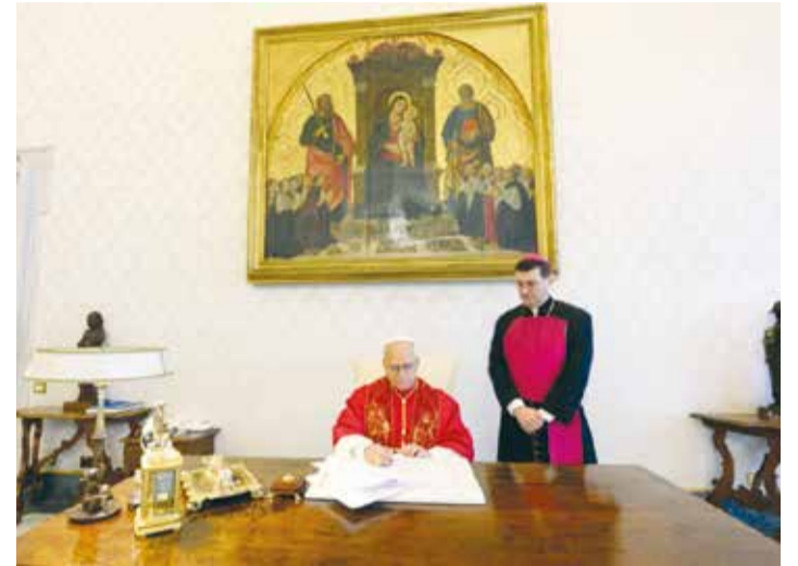
Pope Leo XIV signing his first Encyclical Letter "Magnifica Humanitas", focused on the rise of artificial intelligence, in The Vatican

The Pope has been a high-profile critic of the West Asia war which started with U.S. and Israeli air strikes on Iran in February. He condemned Trump's threat to destroy Iran as "truly