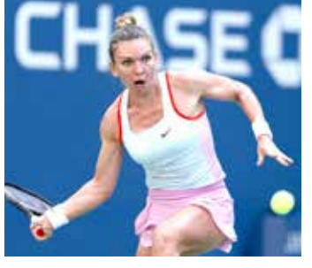
Simona Halep in action (file photo)

"Once again, tonight, I am anti-doping state it, for a quick written in the rules."