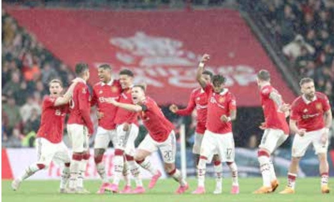
Manchester United's players celebrate during a match (file photo)