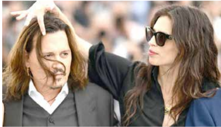
French actress and director Maiwenn adjusts the hair of US actor Johnny Depp