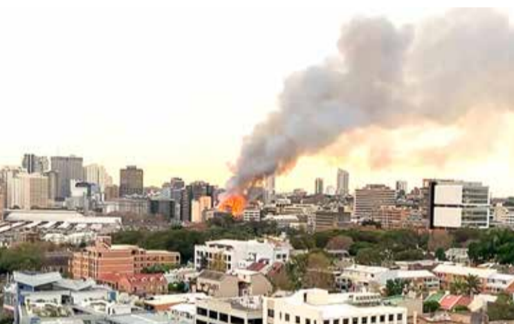
A video grab shows a fire in central Sydney AFP | Sydney

cue NSW said in an update after night fell in the city.