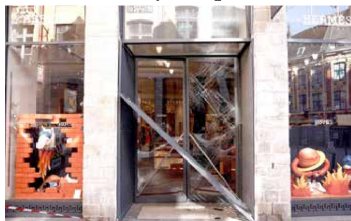
The outside of the Hermes luxury store on rue Grande-Chaussee

The Louis Vuitton shop was itself already burgled in January. The thieves yesterday made off with clothes, jewellery and handbags, but part of the loot