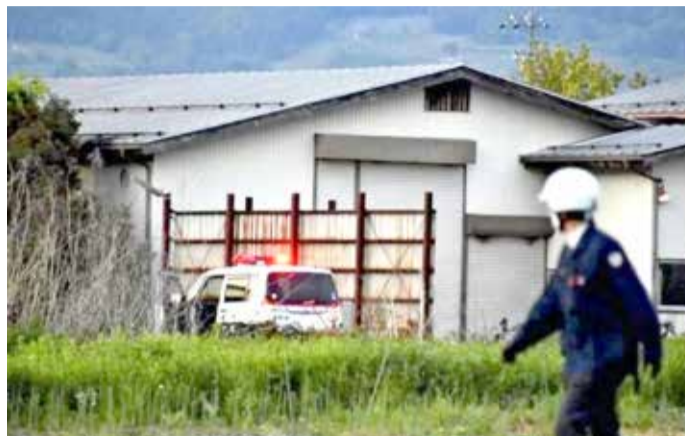
The house where a suspect has barricaded himself with a hunting gun in Nakano City