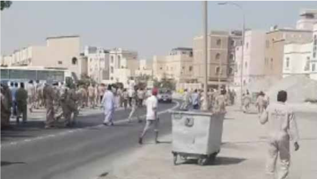
Workers in their uniform taking part in a protest yesterday in Sitra

Workers of a well-known construction company allege non-payment of wages for five months