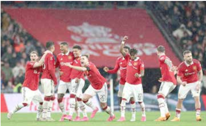
Manchester United's players celebrate during a match (file photo)

"You have to do the right things, you can have money but you have to do it and spend it in a smart way and you need