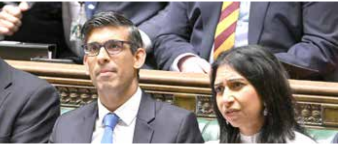
Britain's Prime Minister Rishi Sunak (L) and Britain's Home Secretary Suella Braverman during the weekly session of Prime Minister's Questions (PMQs) at the House of Commons, in London