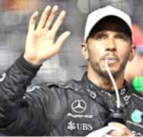
Lewis Hamilton | Monaco

Hamilton will sign new Mercedes deal ‘in coming weeks’