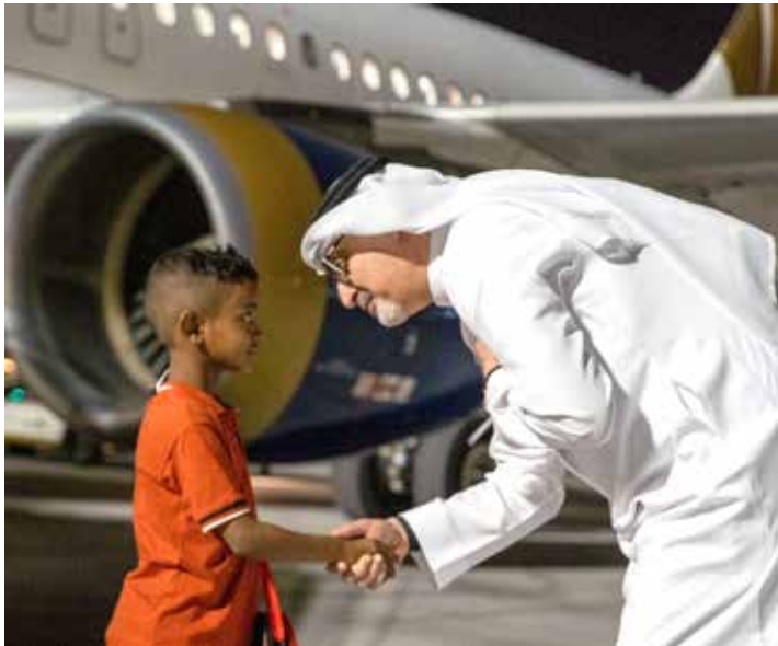
In pictures, officials and medical team assisting Bahraini citizens and residents following their arrival from Sudan at Bahrain International Airport, yesterday

The army "launched a series of unwarranted attacks today",