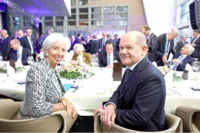
ECB President Christine Lagarde (L) poses with German Chancellor Olaf Scholz during celebrations of the European Central Bank ECB to mark its 25th anniversary at the ECB headquarters in Frankfurt am Main, western Germany

Germany fell into a recession around the turn of the year, official figures published yesterday showed, as inflation and higher interest rates curbed demand in Europe's largest economy. Over the first three months of 2023, the economy shrank by 0.3%, the federal statistics agency Destatis said, downgrading an initial estimate of zero percent. Following a 0.5% contraction in the last three months of 2022, it was Germany's second consecutive quarter of negative growth -- the threshold for a "technical recession". The slump came as Germany battled a surge in energy prices in the wake of the Russian invasion of Ukraine, which weighed on households and businesses. But Chancellor Olaf Scholz, who previously expressed confidence that Germany had done enough to avoid a downturn, played down fears of a prolonged recession. "The German economy's prospects are very good," he said at a press conference, citing significant investments in the country including in battery factories.