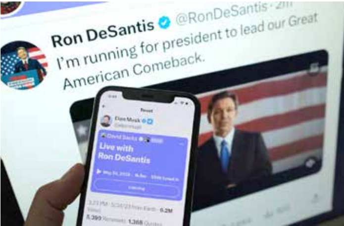
The live Twitter talk with Elon Musk on a background of Ron DeSantis as he announces his 2024 presidential run on his Twitter page

DeSantis finally began speaking after almost half an hour of confusion and chaos -- although what should have been an exultant launch had been thoroughly overshadowed by the time he was able to make his case for the