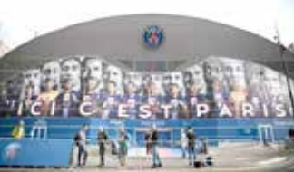
A general view of PSG's Parc des Princes stadium

Sampdoria were one of Italy's leading sides in the 1980s