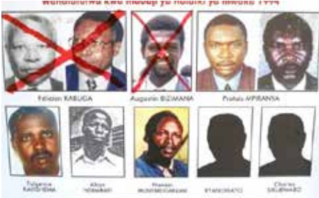
Fulgence Kayishema, bottom left, is pictured on a wanted poster

spector, faces charges of genocide, complicity in and conspiracy to commit genocide, and crimes against humanity.