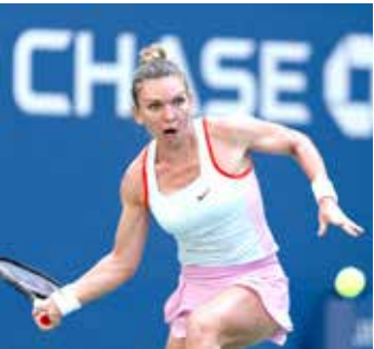
Simona Halep in action (file photo)

devastated," she said in a post on social media.