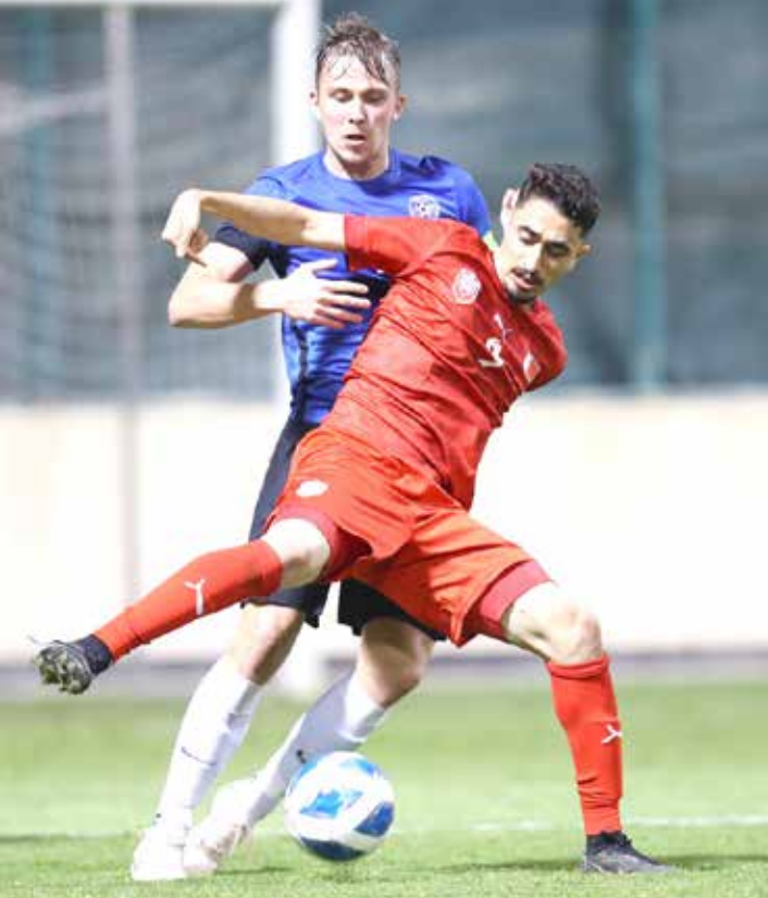
Action from the Olympic team's friendly against Estonia (File)

Following a single round-robin, the 11 group winners and four best second-placed teams among all groups qualify for the AFC U-23 Asian Cup. They join tournament hosts Qatar, who have received automatic qualification, to form the final cast of 16 in the competition, to be played between April 15 and May 3, 2024.