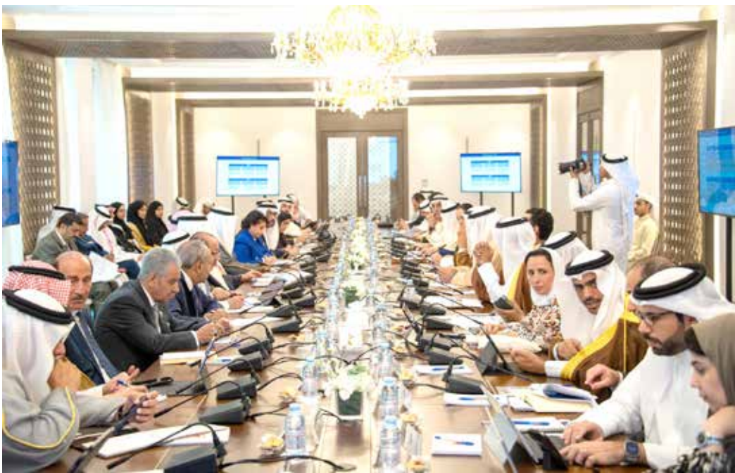
Members of the legislative and executive authorities during a meeting on the state general budget