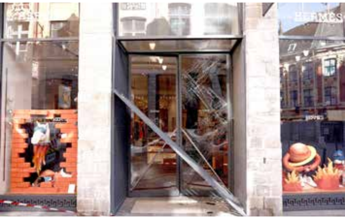
The outside of the Hermes luxury store on rue Grande-Chaussee

The Louis Vuitton shop was itself already burgled in January. The thieves yesterday made off with clothes, jewellery and handbags, but part of the loot