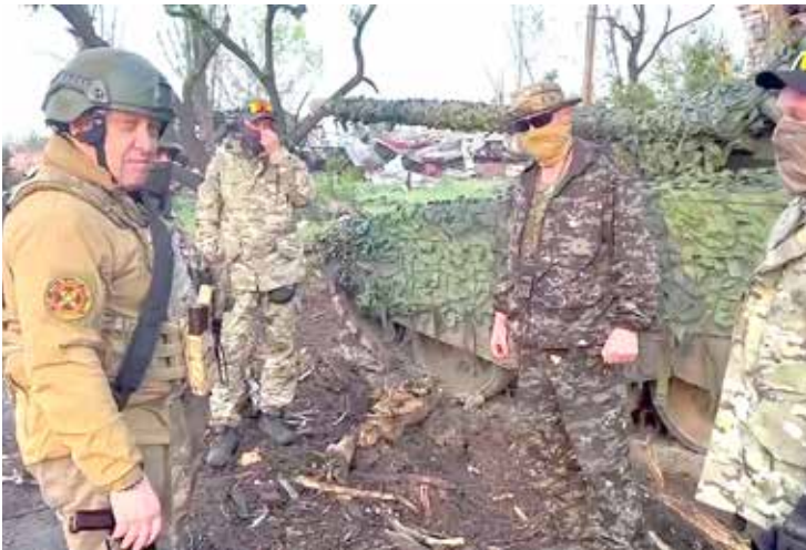
Wagner Chief Yevgeny Prigozhin (L) with fighters in Bakhmut

Ukraine, which denies that Bakhmut has fallen to Russia, insisted it still controlled a "micro district" of the ruined city and