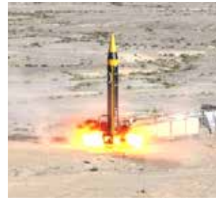
The testing of the fourth generation Khorramshahr ballistic missile, named Kheibar, at an undisclosed location

"Iran's development, and proliferation of, ballistic missiles poses a serious threat to regional and international security and remains a significant non-proliferation challenge," State Department spokesman Matthew Miller told reporters. The Kheibar missile will have a range of 2,000 kilometers (1,242 miles) and be able to carry warheads weighing over one tonne, Iran's defence ministry said.