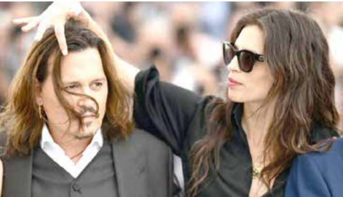
French actress and director Maiwenn adjusts the hair of US actor Johnny Depp