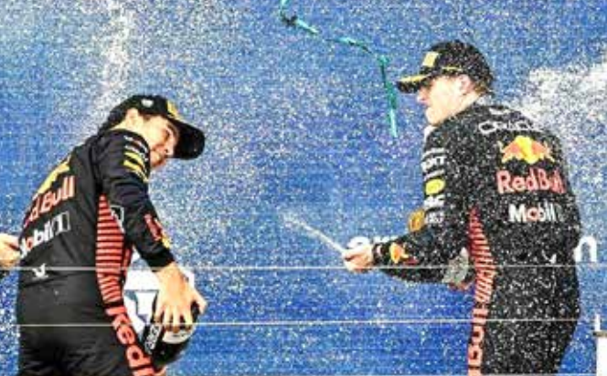
Red Bull Racing’s Max Verstappen (R) and teammate Sergio Perez celebrate on the podium after Miami Grand Prix (file photo)