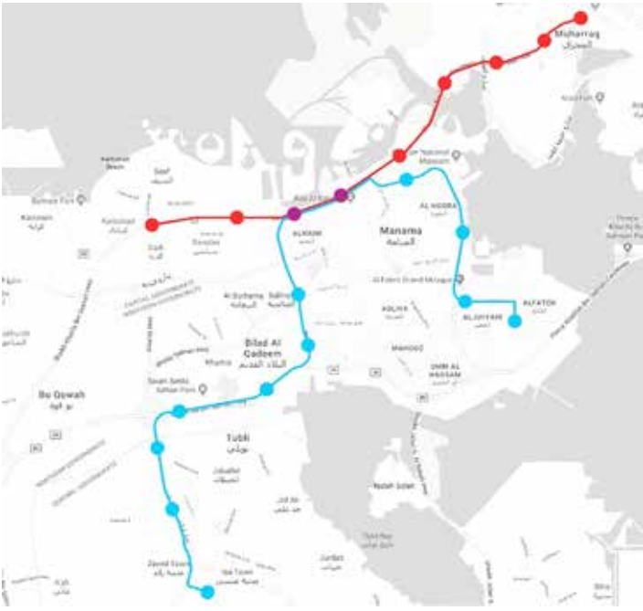
The project has already commenced in key areas such as Muharraq, King Faisal Street, Juffair, the Diplomatic Area, Seef District, Salmaniya, Adhari, and Isa Town.

If things are to progress as planned, the long-cherished dream of the Metro will soon become a reality in the Kingdom. The Ministry of Transportation and Communication said that works are progressing to bring the project to fruition, which will also be a part of the 2,117km GCC Railway connecting key cities in each of the six Gulf Cooperation Council member states. Yesterday, officials from the Ministry of Transportation confirmed that the first phase of the project, encompassing 20 stations over 29 kilometers, will be linked to the King Hamad International Passenger Station through an 8 km line with four stops. The project has already commenced in key locations such as Muharraq, King Faisal Street, Juffair, the Diplomatic Area, Seef District, Salmaniya, Adhari, and Isa Town. The first line will connect the Airport to the Seef District, while the other line will connect