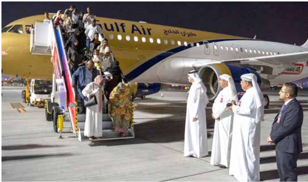
Officials welcoming Bahraini citizens and residents returning from Sudan