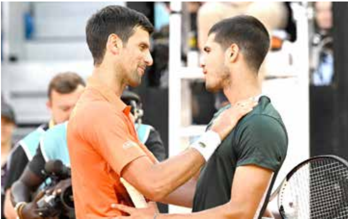
Spain's Carlos Alcaraz (R) and Serbia's Novak Djokovic shake hands after a match (file photo)

He failed to go beyond the last eight at any of the three events he played on clay this spring,