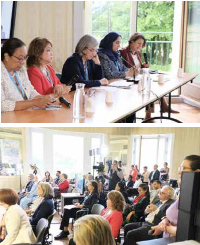
Minister of Health, Dr. Jalila bint Al-Sayed Jawad Hassan, yesterday emphasised the urgent need to address the issue of obesity during an international gathering focused on the World Health Organisation's (WHO) strategy to combat obesity. The minister stressed Bahrain's commitment to tackling this challenge in alignment with the goals of development, during the event took place on the sidelines of the 76th session of the World Health Assembly at the Palace of Nations in Geneva. With over 100 participants from around the globe, the function commenced with speeches from delegates from Bahrain, Seychelles, Portugal, and the Philippines.

stani embassy has also stepped in to assist. "They have asked us to email all the issues and the names of the affected workers." Similarly, the embassies of India and Bangladesh have taken action after receiving complaints from their nationals. In addition, a complaint was lodged at the labour court yesterday. "We hope to get a response in the upcoming week," he said. The protesting workers, however, acknowledged the support received from government officials but emphasised the need for a prompt resolution to this issue. The Daily Tribune's attempted to contact the company officials by phone but received no response.