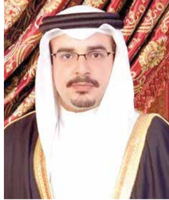
HRH the Crown Prince and Prime Minister