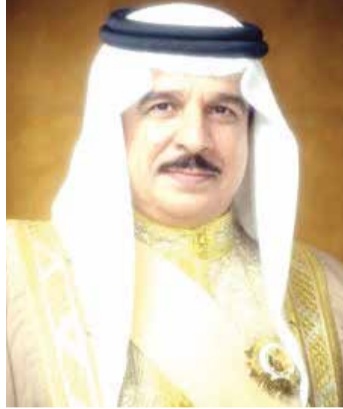
HM the King

HM King Hamad and HRH the Crown Prince and Prime Minister wished mercy upon the victims and speedy recovery for the injured.