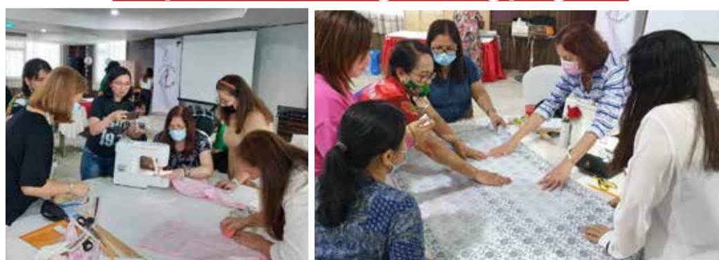
Filipino organisation Pinay Ikaw Na! (PIN), in collaboration with the Overseas Workers Welfare Administration (OWWA) Bahrain, is currently holding a dressmaking training program at the Arman Hotel in Juffair. Thirty Filipinos are taking part in the six-Friday training session program, which started on April 29 and will run until June 3. The course prepares trainees to be qualified dressmakers that will enable them to draft and cut pattern, lay out pattern on the material or fabric, sew and apply finishing touches on ladies casual apparel, which consist of casual dress, blouse, skirt, set of pajama, trouser and shorts. Apart from dressmaking training lined up activities include baking, food processing and hair cutting. The graduation ceremony has been set on June 10 at the Cultural Hall of Bahrain Museum.