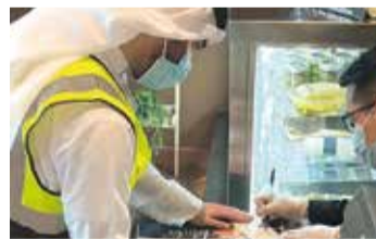
An inspection of a trading outlet in progress

Forty trading outlets have been inspected across Bahrain