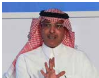
Saudi Finance Minister, Mohammed al-Jadaan

Jadaan did not offer further details, but on May 1 the two countries said in a joint statement that they would discuss the possibility of supporting the deposit by extending its term "or through other options." Pakistan is in dire need of external finances, hurt by high inflation, reserves declining to as low as less than two months' of imports, and a