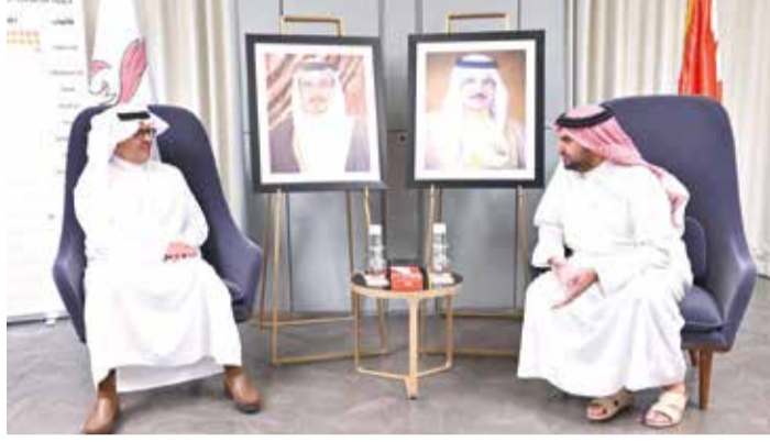
HH Shaikh Isa bin Ali bin Khalifa Al Khalifa, right, with Prince Sultan bin Saad Al Saud