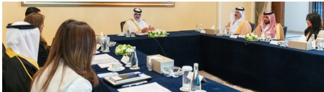
HH Shaikh Isa chairs the Board of Trustees meeting

HH Shaikh Isa noted that Bahraini citizens are the Kingdom's most valuable resources and stressed the importance of continuing to invest in their educa-