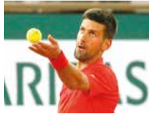
Novak Djokovic | Paris

World number one and defending champion Novak Djokovic eased into the French Open third round on Wednesday by defeating the new pupil of his former long-time coach.