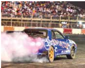
A car in action during a burnout event at BIC

Participants come from far and wide to put on a fantastic show of rising white smoke at BIC's Vehicle Dynamics Area for the throngs in the stands.