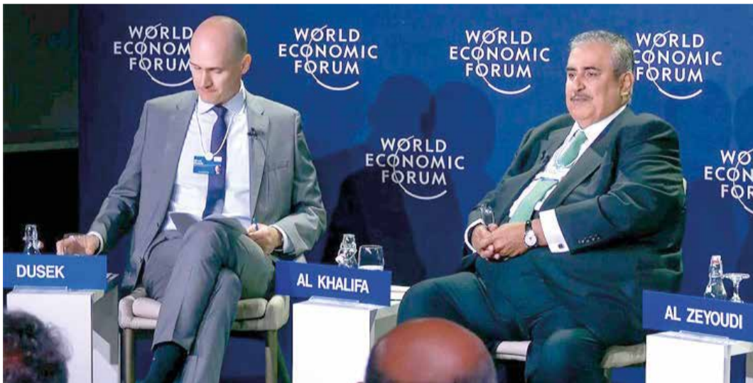
HM the King's Advisor at the forum

The peace declaration accord designed between the Kingdom and the State of Israel reflects the wise approach of His Majesty King Hamad bin Isa Al Khalifa.