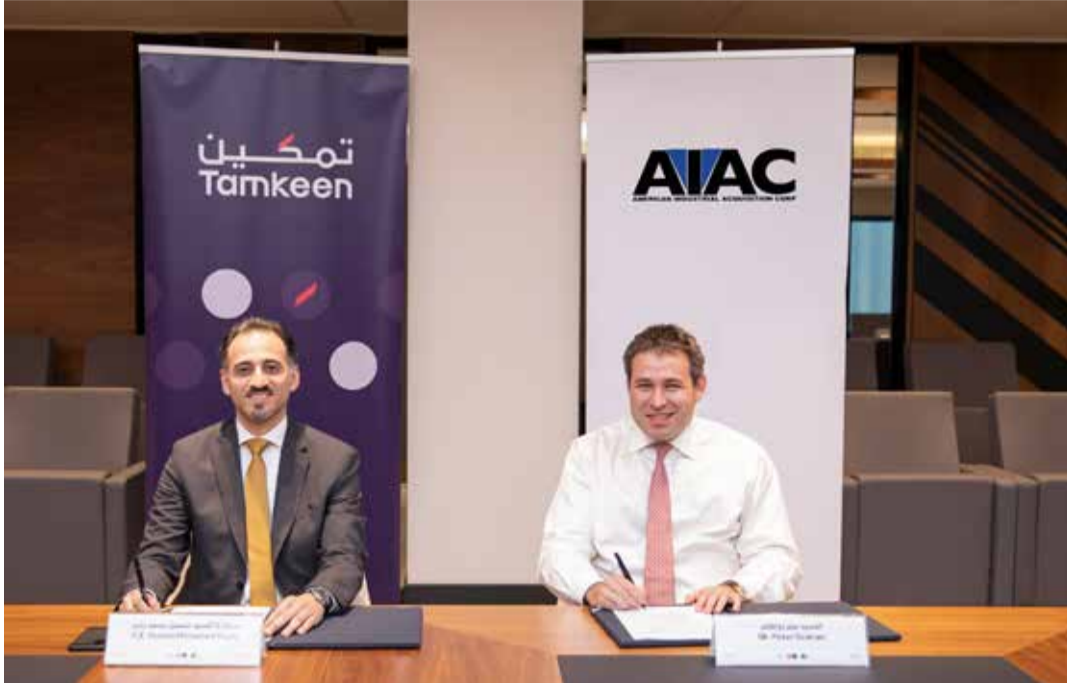
The deal signing. AIAC will provide advisory support as part of Tamkeen's recently launched Business Turnaround programme

The Labour Fund (Tamkeen) announced signing a new strategic cooperation agreement with the American Industrial