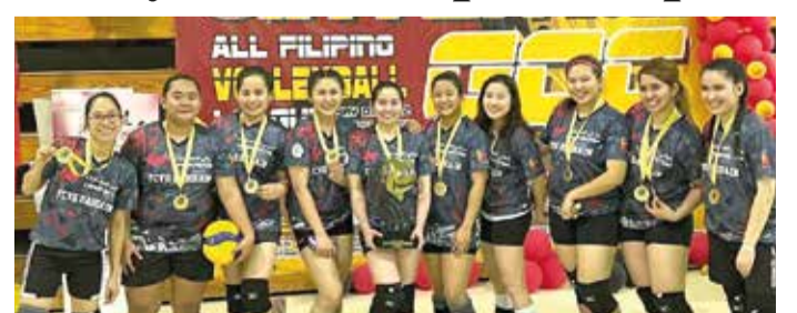
Bahrain team celebrates after the event

The event, which witnessed the participation of several teams from Bahrain and neighbouring GCC states, was organised by the Filipino Club Volleyball Group (FCVG); a core group under the Filipino Club Bahrain umbrella, since 2013.