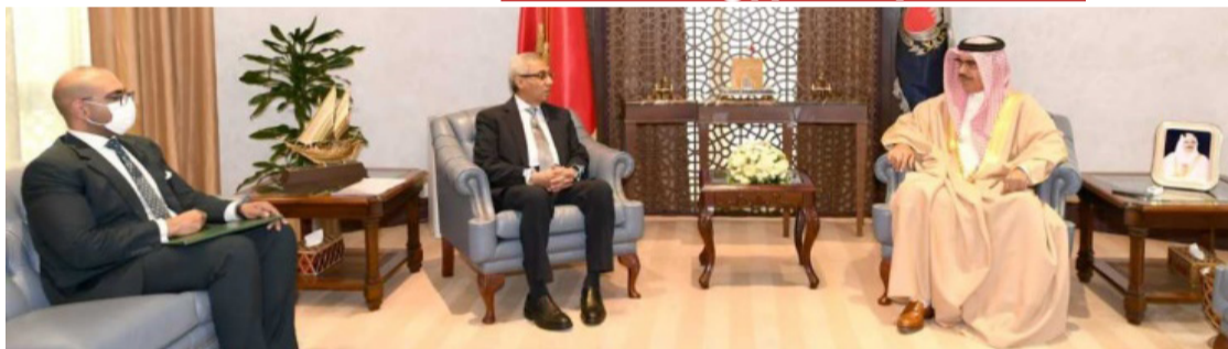
Interior Minister, General Shaikh Rashid bin Abdullah Al Khalifa, received yesterday Egyptian Ambassador to the Kingdom of Bahrain, Yasser Mohammed Shaban. He welcomed him, hailing historical fraternal relations between both countries and mutual keenness to develop bilateral cooperation, mainly in the security fields.