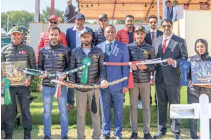
Riders of the Royal Endurance Team with their awards

The great achievement of HH Shaikh Nasser bin Hamad Al Khalifa, Representative of HM the King for Humanitarian Works and Youth Affairs, Captain of the Royal Endurance Team in the Windsor International Endurance Championship, represented a milestone in Bahraini sport as it's a unique accomplishment confirms the