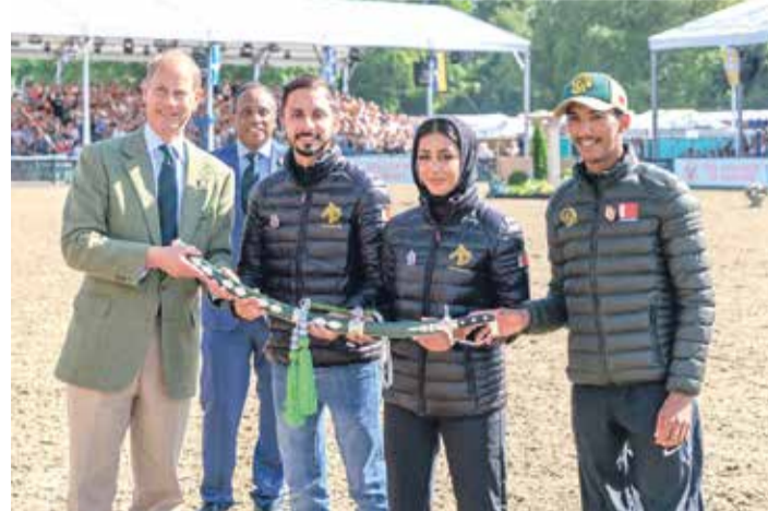
Prince Edward, Earl of Wessex, with the riders during the awarding ceremony

This great success was a catalyst for the Royal Endurance Team by confirming its strong