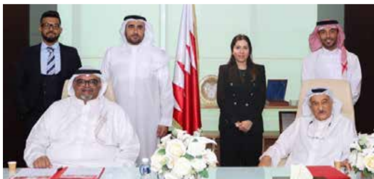
The Supreme Council of Health (SCH) signed an agreement with (Aon) Insurance Company. The agreement came to implement the insurance project for foreign residents within the framework of the implementation of the National Health Insurance Program. President of the Supreme Council of Health (SCH) Lieutenant General Dr Shaikh Mohammed bin Abdullah Al Khalifa stressed Bahrain's efforts to ensure the sustainability of providing comprehensive health coverage to foreign residents, in accordance with the best global standards. The project aims to ensure coverage of basic health services for all foreign residents by providing a package that includes primary and secondary health services, and emergency and accident coverages ensured by private health insurance companies.