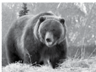
Grizzly bears are some of the largest carnivores on Earth