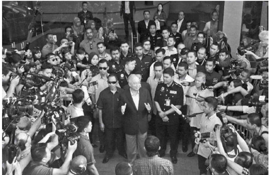
Former Malaysian Prime Minister Najib Razak, centre, speaks to media as he leaves the Malaysian Anti-Corruption Commission (MACC) Office yesterday

Najib has stepped down as party president after the election loss and hasn't yet transferred the money to the new leadership, the statement said.