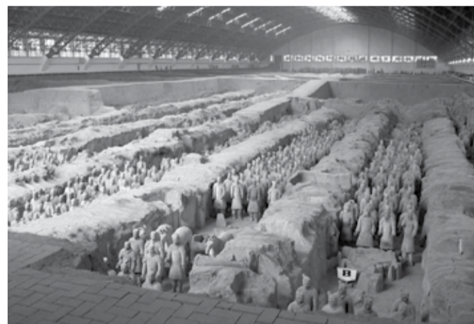
Terracotta warriors and horses stand in partially unearthed pits at the Museum of Qin Terracotta Warriors and Horses, in Xi'an