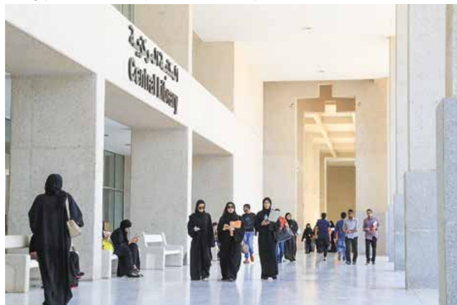
Students walk through one of the corridors of the university.