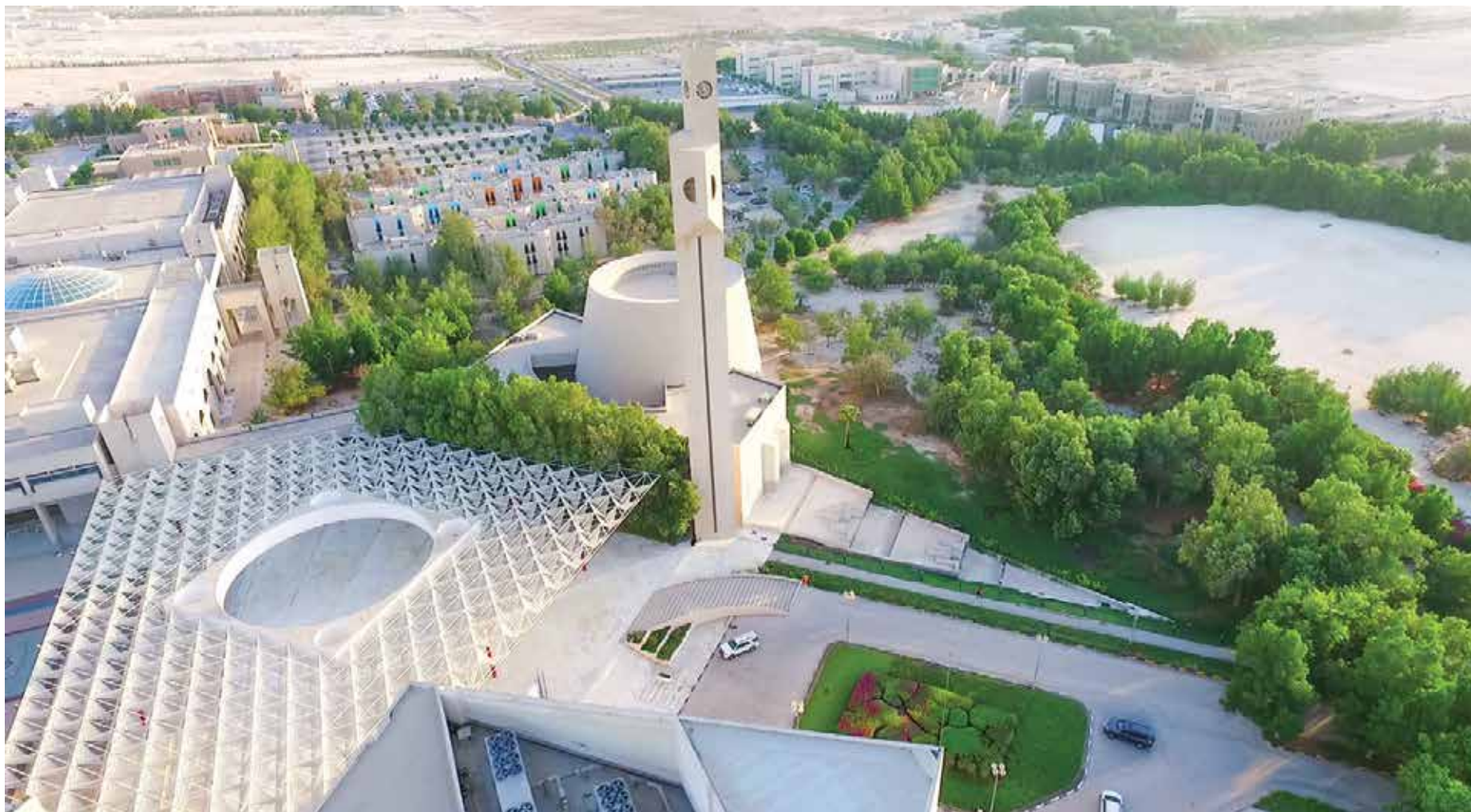
An aerial view of the university.

University of Bahrain hardly has the infrastructure to support the rapidly increasing strength, say students