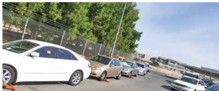
Parking space crisis haunts every student at the university.