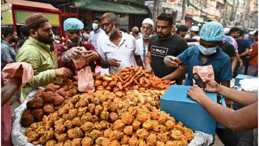
People buy food at a market in Dhaka