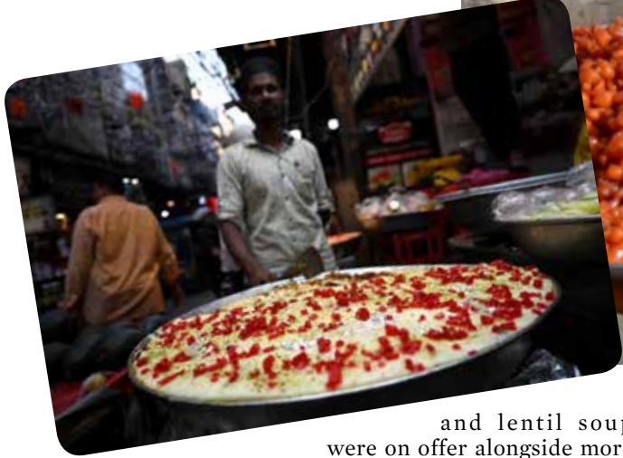
A vendor selling jalebis waits for customers in Kandahar

Huge crowds returned to the neighbourhood this year for the