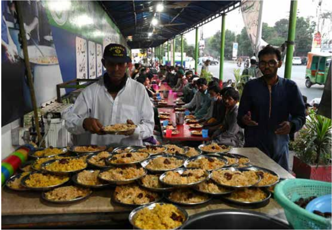
Volunteers distribute food plates in Lahore