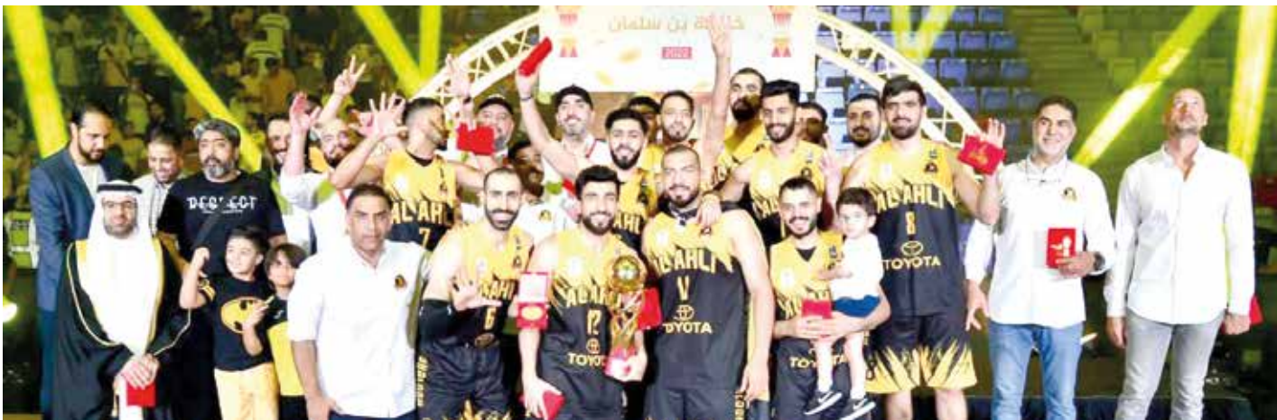
Al Ahli players and officials celebrate at the awarding

Al Ahli capture Khalifa bin Salman Cup for third successive season after defeating arch-rivals Manama in tournament final