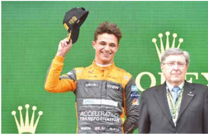
McLaren's Lando Norris celebrates third place on the podium

Asked whether he felt he had the third fastest car, Nor-