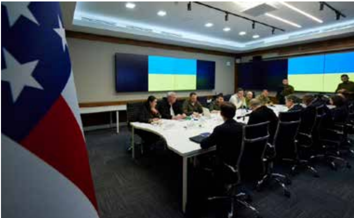
U.S. Secretary of State Antony Blinken and U.S. Defense Secretary Lloyd Austin attend a meeting with Ukraine's President Volodymyr Zelenskiy

US President Joe Biden pledged $800 million in more weaponry for Ukraine on Thursday and said he would ask Congress for more money to help bolster support