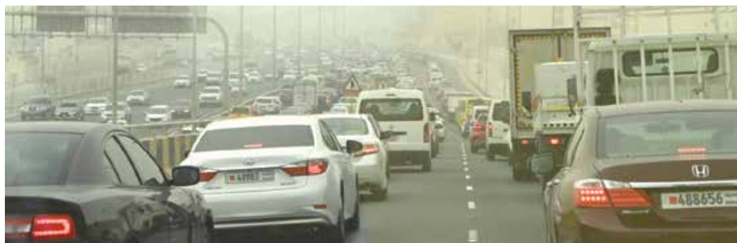
Low levels of horizontal visibility across all major highways in the Kingdom yesterday

The Kingdom is among the 10 nations having the worst air quality. Conducted by Swiss firm IQAir, the 2021 World