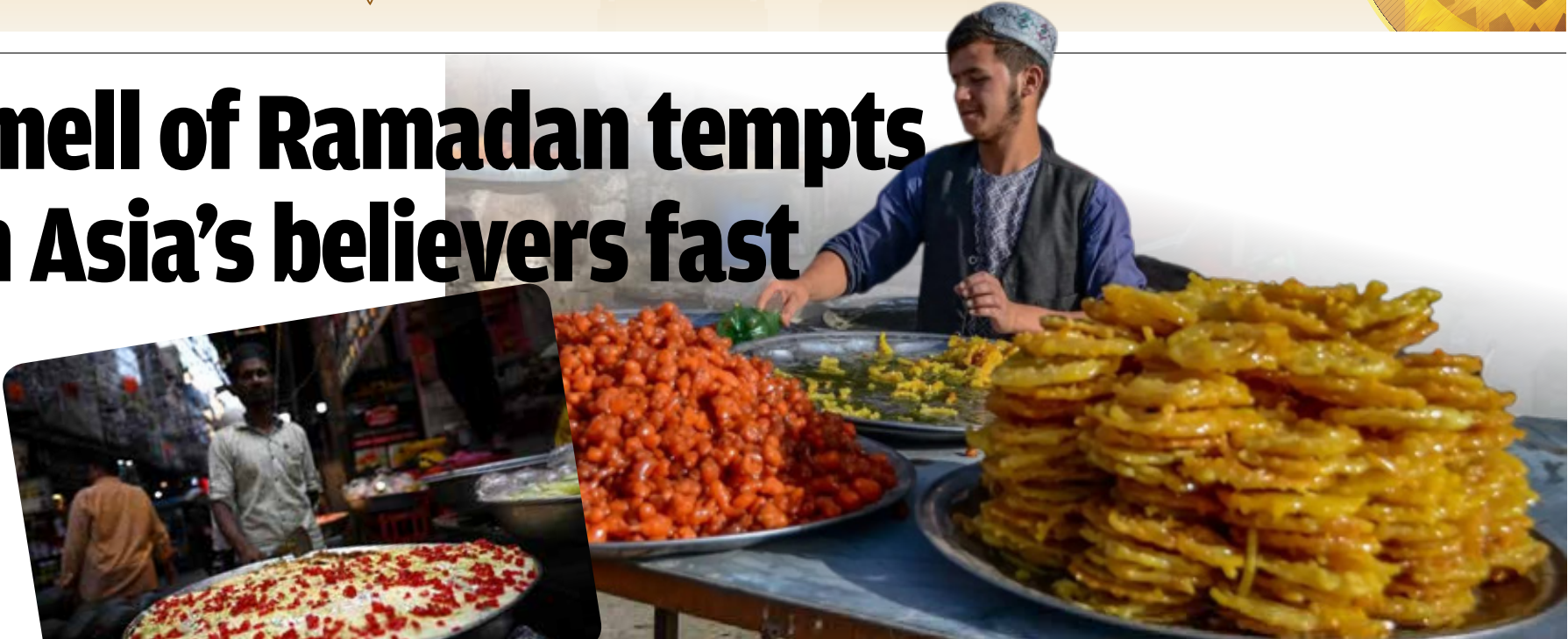
A vendor selling jalebis waits for customers in Kandahar

Mosques and market streets teem with evening crowds tempted by the scent of syrupy sweets and hefty rice plates, as more than half a billion believers across southern Asia break the day’s Ramadan fast. The fast is conceived as a spiritual struggle against the seduction of earthly pleasures -- but for the nightly “iftar” meal, festive meals traditionally bring families together and there is intense social activity. The centuries-old Chawkbazar market in Bangladesh is a traditional centre for evening meet-ups during Ramadan, with hundreds of makeshift food stalls selling traditional grilled meats and delicacies. Huge crowds returned to the neighbourhood this year for the