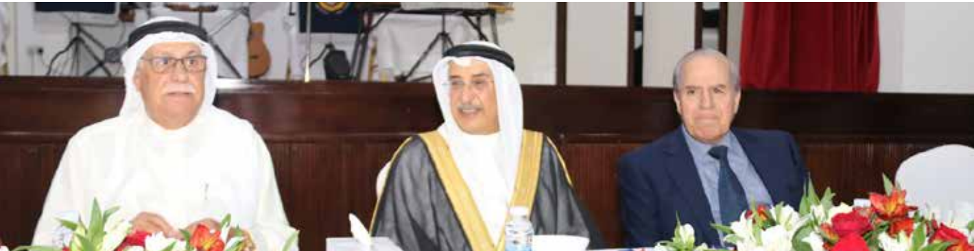
Deputy Prime Minister Shaikh Khalid bin Abdullah at the event