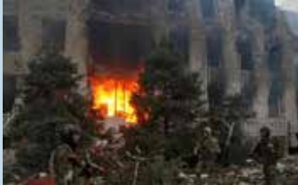
Service members of pro-Russian troops, including fighters of the Chechen special forces unit, stand in front of the destroyed administration building of Azovstal Iron and Steel Works

The ministry said any civilians trapped at the facility could leave in whichever direction they chose.