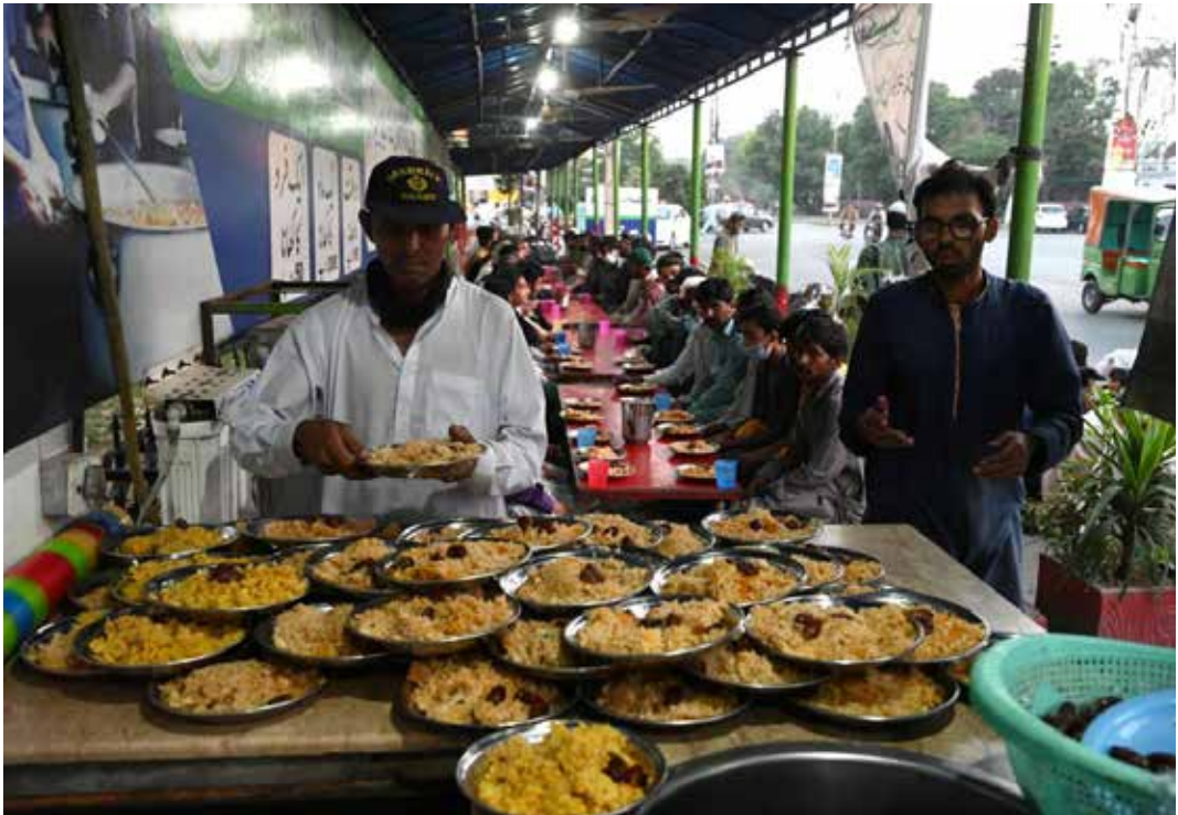
Volunteers distribute food plates in Lahore