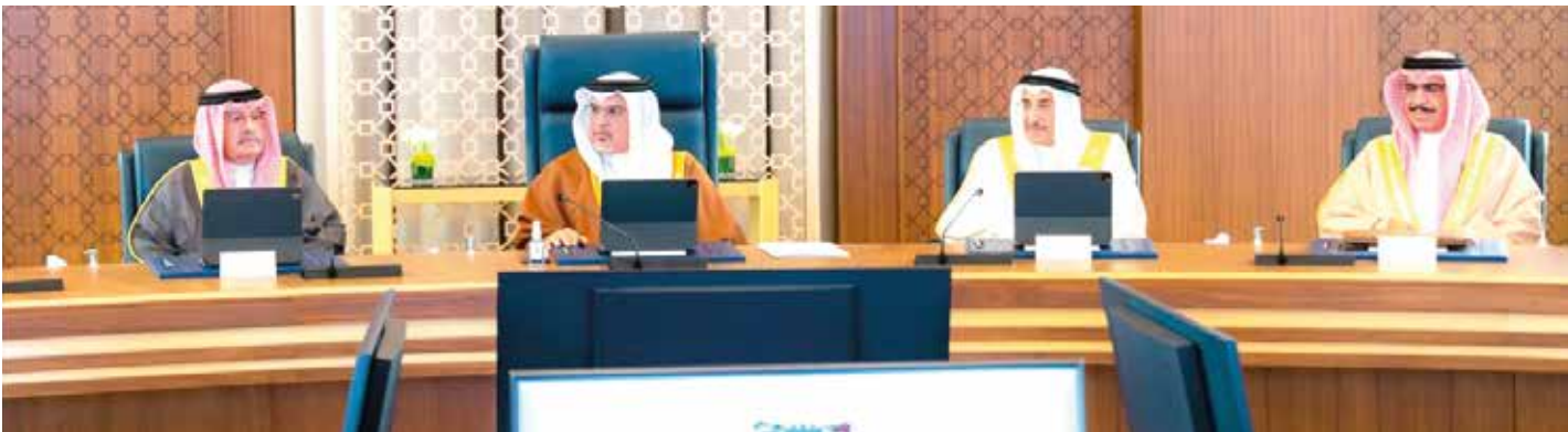
HRH the Crown Prince and Prime Minister chairs the weekly Cabinet meeting

For Labour Day, the Cabinet emphasised the dedication and contribution of the Kingdom's workforce to Bahrain's success-