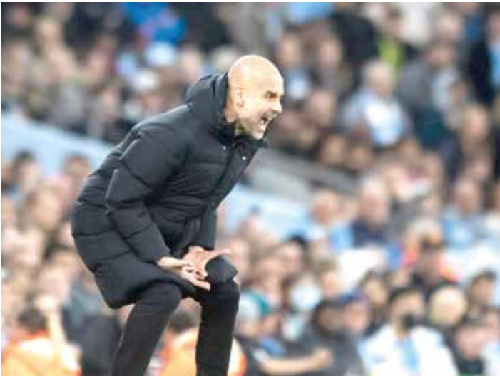
Pep Guardiola reacts during a match (file photo)

In contrast City, who have been the dominant force in English domestic football over the past decade, appeared in