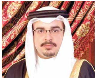
HRH the Crown Prince and Prime Minister

His Majesty King Hamad bin Isa Al Khalifa and His Royal Highness Prince Salman bin Hamad Al Khalifa,