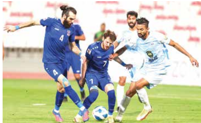
Riffa and Manama...engaged in tight, two-horse race for title (File photo)

The title race has gone down to the last day of play between defending champions Riffa and chief title rivals Manama, with only three points separating the two teams heading into Week 18.