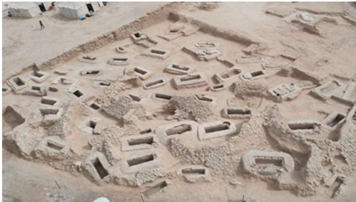
The site of Abu Saiba is a hill tomb dating back to the Middle Tylos period

During this year 2022, 23 new tombs were discovered, while 11 were completely excavated, and out of these 11 burials that were excavated, three were intact, the others were deliberately looted and robbed, most likely in antiquity, though they still yield