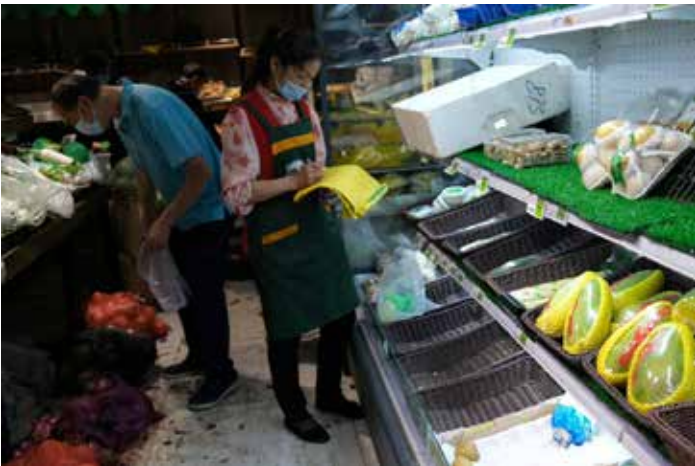
A staff member takes notes of goods at a half empty freezer for fruits at a supermarket in Beijing

"Shanghai was a lesson," he said, adding that he doesn't believe Beijing will suffer the same