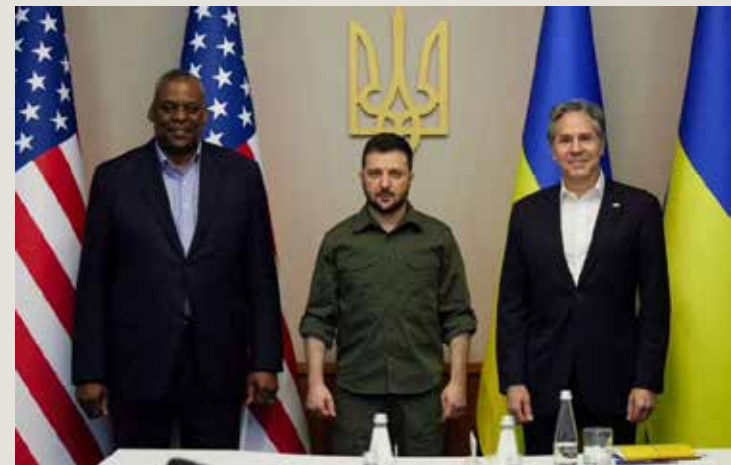
Ukraine's President Volodymyr Zelenskyy poses for a picture with U.S. Secretary of State Antony Blinken and US Defence Secretary Lloyd Austin

iv embassy soon, says Russia has failed in war aims