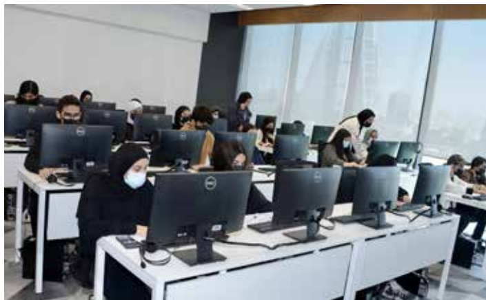
Evaluation of applicants' credentials is underway

The Royal Highness Prince Salman bin Hamad Al Khalifa, the Crown Prince and Prime