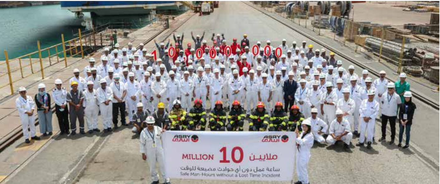
On 13 April 2022, ASRY surpassed 10 million manhours, without an LTI