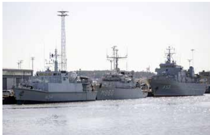
Three NATO warships from the Standing Nato Mine Countermeasures Group 1 (SNMCMG1 group), EML Sakala from Estonia, Dutch HNLMS Schiedam and the flagship LVNS Virsaitis from Latvia, arrive to a harbour, to train with Finland's coastal fleet, in the Finnish southwestern coastal city of Turku, Finland