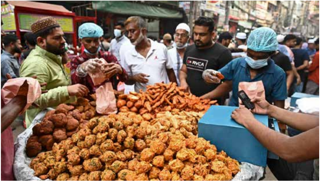
People buy food at a market in Dhaka