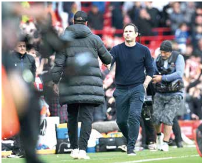
Juergen Klopp, Manager of Liverpool embraces Frank Lampard, Manager of Everton after the Premier League match