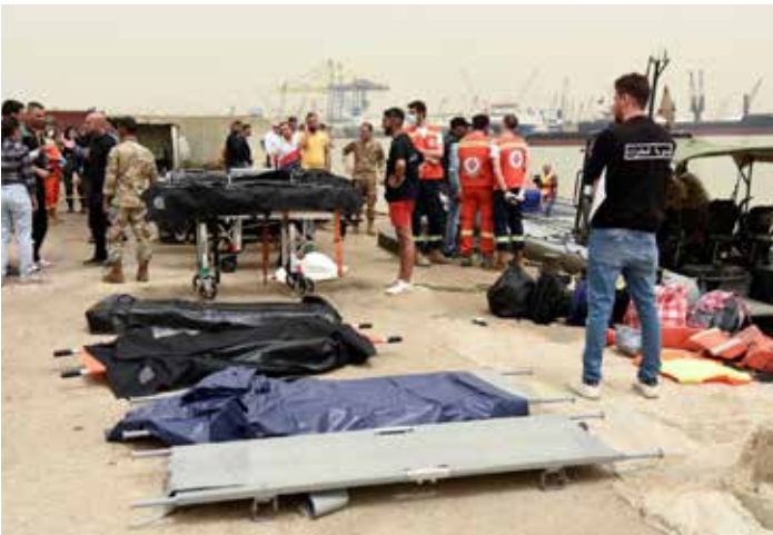
People stand near stretchers that are prepared for dead bodies after a boat capsized off the Lebanese coast of Tripoli overnight, at port of Tripoli, northern Lebanon

"I tried to grab my son but I got a blanket instead. The water took him from me"