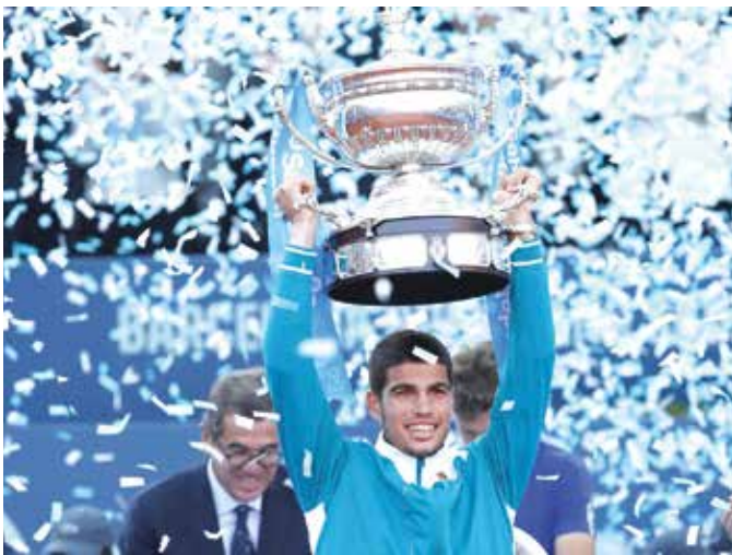
Spain's Carlos Alcaraz holds a trophy as he celebrates after his win