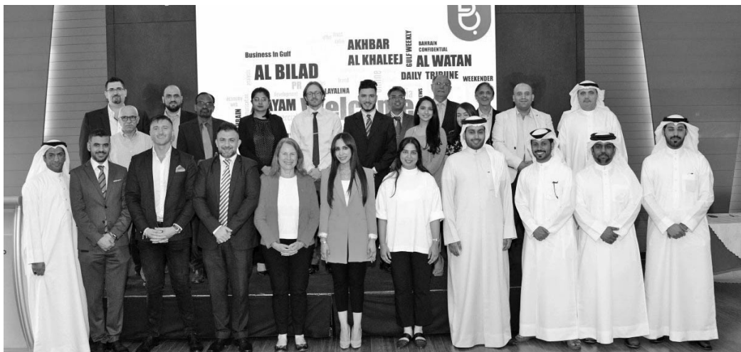
Batelco, a leading digital solutions provider in Bahrain, hosted a lunch gathering for members of the media recently at Batelco Headquarters, Hamala. The lunch was hosted by Batelco to extend their appreciation to the media for the vital role they play in all sectors in the Kingdom

The carmaker said it sold 458,479 vehicles in the three months ended March 31, down 0.7pc.