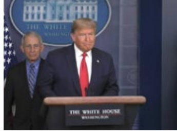
Trump declares coronavirus fight close to end