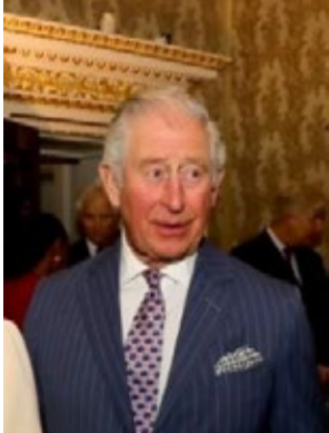
Prince Charles, the heir to the British throne, has tested positive for coronavirus, a spokeswoman said. Charles is 71 years old.