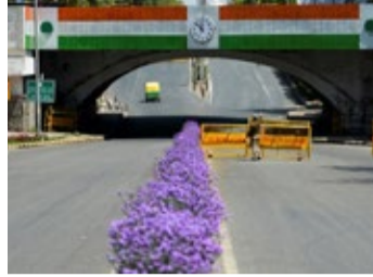
Deserted roads in New Delhi