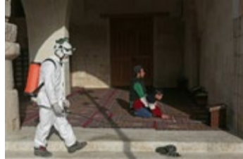
Members of the Syrian Civil Defence (White Helmets) disinfect a mosque in the Syrian city of al-Bab

But Trump is not convinced the move is worth the enormous economic cost.