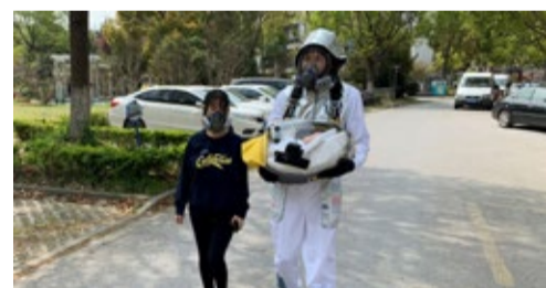
Shanghai

The father of a two-month-old infant in Shanghai has created a custom-built pod complete with an air purification system to keep his baby safe from the coronavirus outbreak.