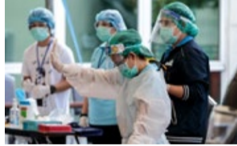
Medical staff dressed in protective gear prepare to test people for COVID-19 at a drive-through centre at Vibhavadi Hospital in Bangkok