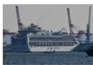
Yokohama | Japan

The Diamond Princess, a coronavirus-hit cruise ship off Japan that saw 712 passengers and crew contracting the disease with 10 deaths, left its moorings in Yokohama yesterday, a city official said.