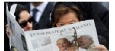
A woman reads a copy of the Vatican newspaper L'Osservatore Romano