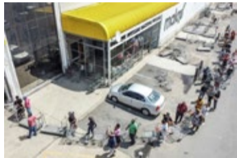
Customers queue outside a super store in Soweto as South Africa enters a 21-day national lockdown