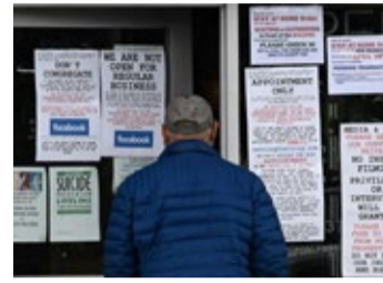
Gun stores in the US have seen an uptick in business as a result of the spreading coronavirus pandemic

Dubai directed private sector companies to implement remote working systems for 80 per cent of staff from now until April 9, the authority regulating business in the emirate, Dubai Economy, said on Twitter on Wednesday. Pharmacies, grocery stores, supermarkets and cooperative societies were excluded from the worder.