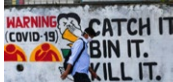
India ordered its 1.3 billion people to stay at home for three weeks