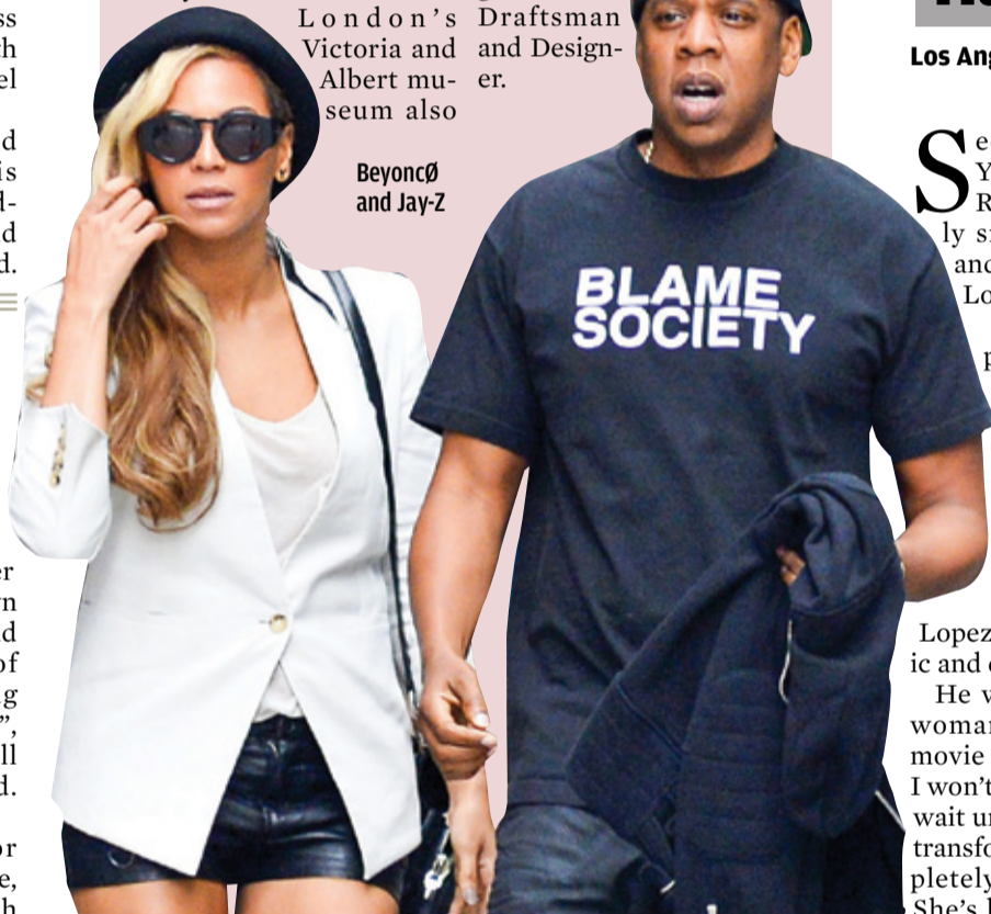
Beyoncé and Jay-Z

Michelangelo: Divine Draftsman and Designer.