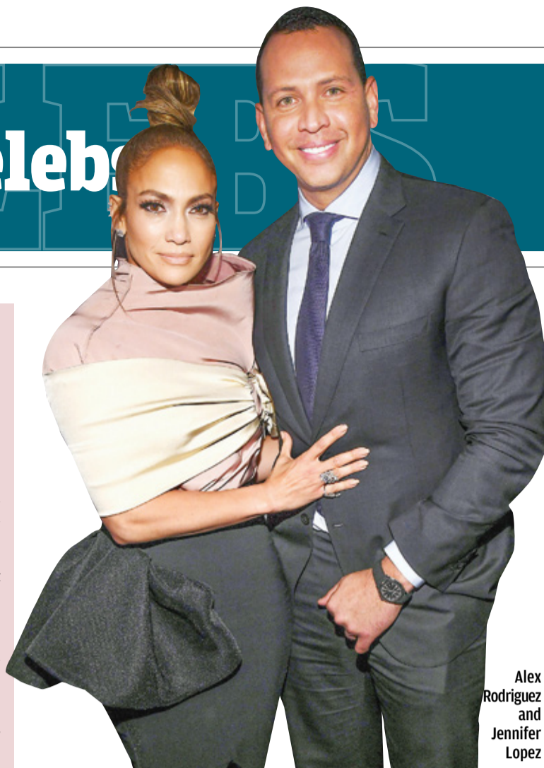
Alex Rodriguez and Jennifer Lopez