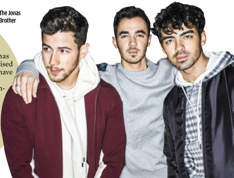
The Jonas Brother

Nick also uploaded a photo of himself looking off into the distance and captioned it "shooting something."