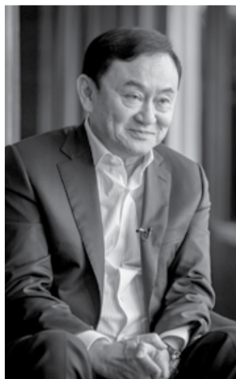
Exiled former Thai prime minister Thaksin Shinawatra