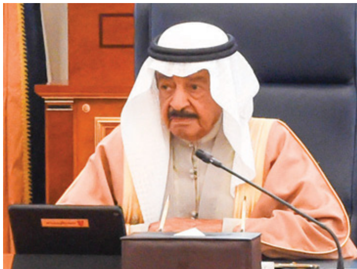
HRH the Premier chairs the Cabinet session.

He paid tribute to His Majesty King Hamad bin Isa Al Khalifa and His Royal Highness Prince Salman bin Hamad Al Khalifa, HRH the Premier and Crown Prince, Deputy Supreme Commander and First Deputy