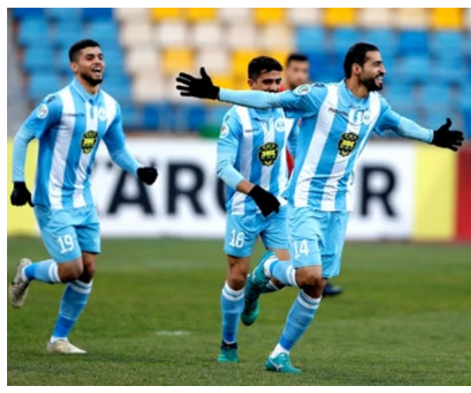
Riffa's Haram, no. 14, celebrates after scoring their opening goal yesterday