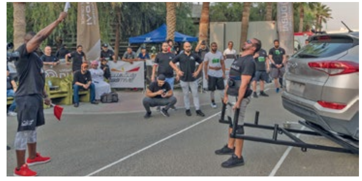
A participant in action during the event

in April under the patronage of The championship is part of