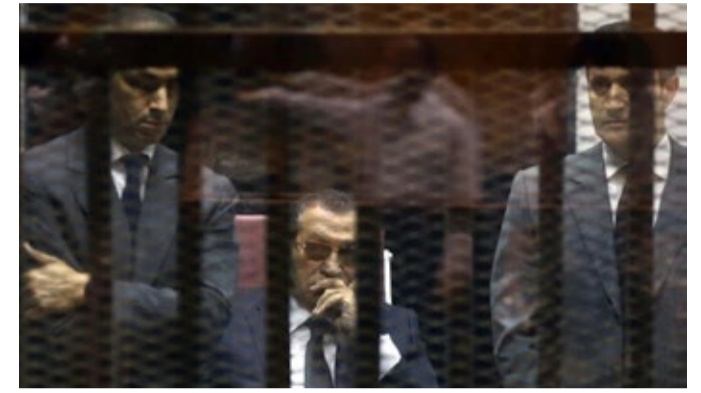
A 2015 photo shows ousted Egyptian president Hosni Mubarak in a Cairo court between his sons Gamal (L) and Alaa