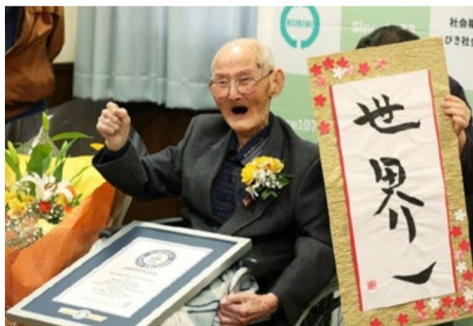
Chitetsu Watanabe after being recognised as the world's oldest living male. He has died away aged 112