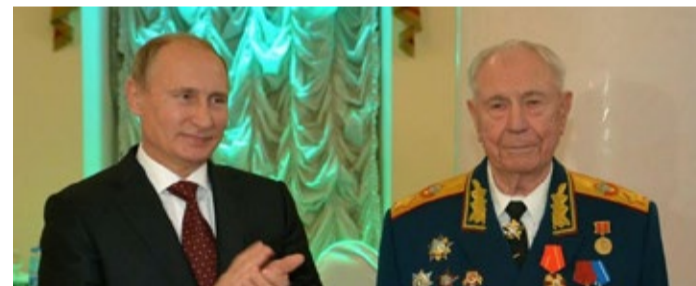
The last marshal of the Soviet Union Dmitry Yazov (right), with President Vladimir Putin, has died aged 95

Defence minister between 1987 and 1991, Yazov participated in a coup attempt against Gorbachev in August 1991, a year after being awarded the rank of marshal.