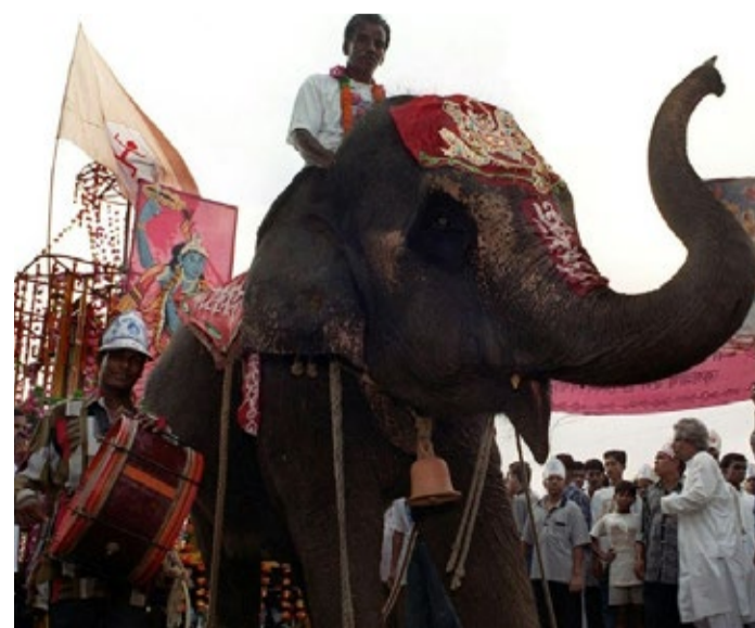
A mahout guides a decorated elephant in Dhaka

"The mahouts (elephant caretakers) are unhappy that we stopped a source of their