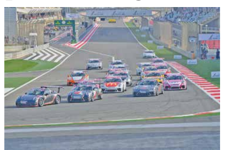
Action from last season

Launched in 2009, series competition returns for a landmark 11th campaign. It was created to give the region's home-grown