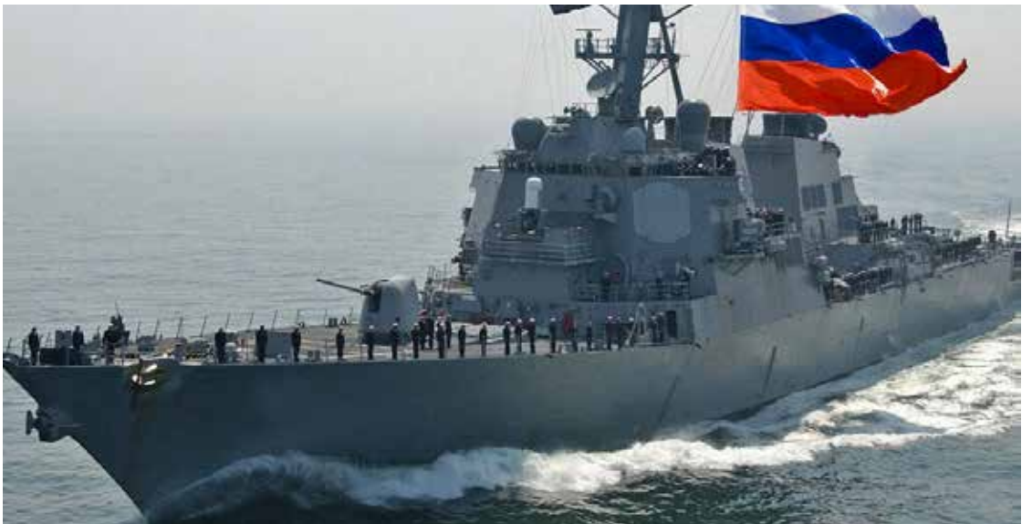
Representative picture

● The Admiral Vinogradov verbally warned USS John S. McCain