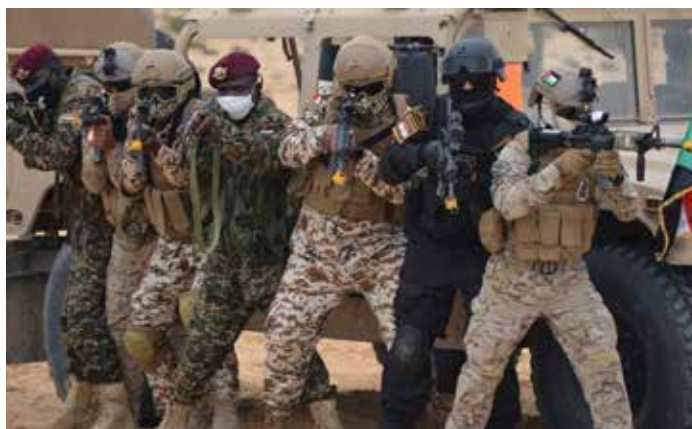
Military exercise in progress

The advanced stage of the exercise reflects the efficiency and ability of the participating forces in carrying out the tasks