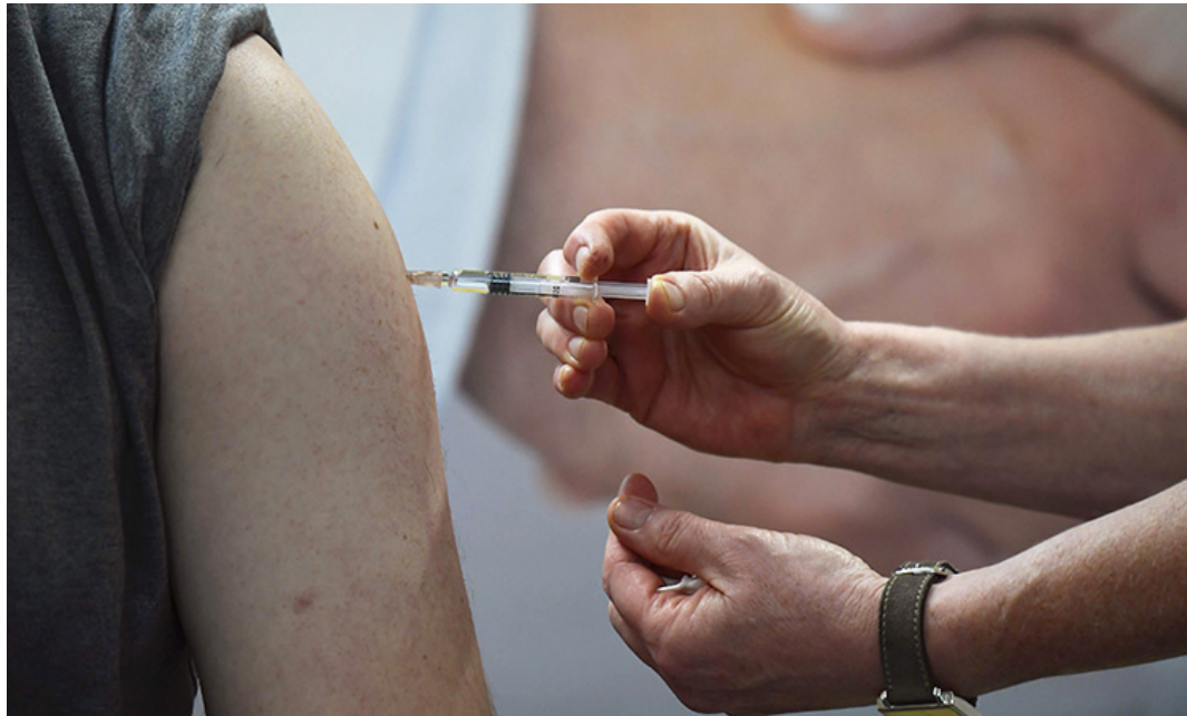
A shot of hope and a return to normal

But now there is hope. If everything goes well, at best,