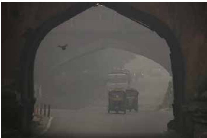
Commuters drive amid heavy smog early morning in New Delhi

flight for checking the capabilities for cloud seeding, the readiness and endurance of the aircraft, the capability assessment of the cloud seeding fitments and flares, and coordination among all involved agencies."