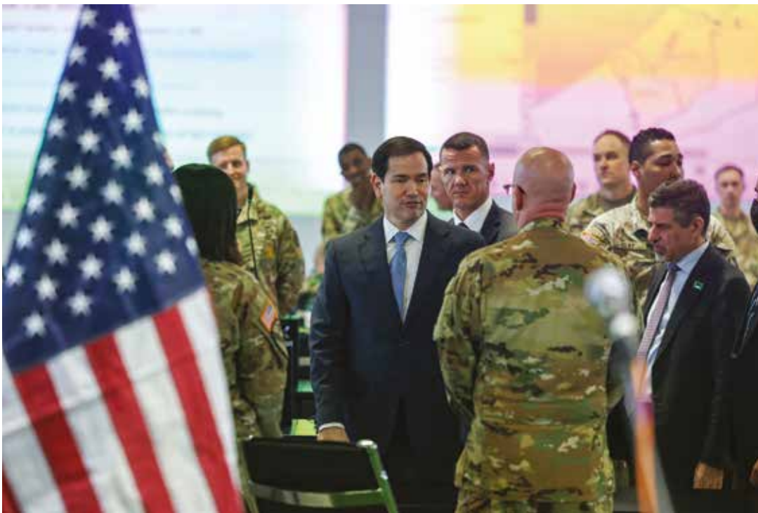
US Secretary of State Marco Rubio listens to US military personnel as he visits the Civil-Military Coordination Center in southern Israel

He confirmed that Israel would enjoy vetoes on the force composition, amid reports Israel