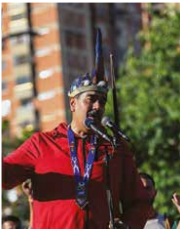
Venezuela's President Nicolas Maduro speaks during a march to commemorate the "Day of Indigenous Resistance" in Caracas (file photo)

The United States has deployed stealth warplanes and navy ships as part of what it calls anti-narcotics efforts, but has yet to release evidence that its targets -- eight boats and a semi-submersible -- were smuggling drugs.