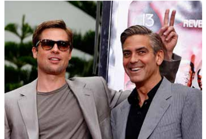
Brad Pitt calls George Clooney