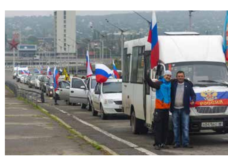
Two men pose for a photo in front of motorcade organized to support voting in a referendum in Luhansk, eastern Ukraine

Irpin, close to the capital, was recaptured after weeks of fighting could include the use of "strategic and residents have rallied to start nuclear weapons". rebuilding before winter sets in. Irpin -- dubbed a "hero city" by "crimes against international law gunshot wounds."