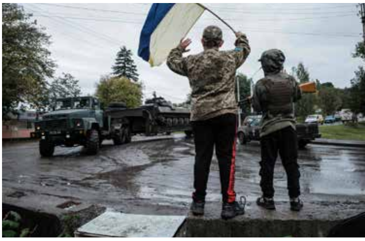
Two boys cheer at passing vehicles from their mimicked checkpoint at the curve of a road in Chuhuiv, Kharkiv region

ks deputy defence minister after battlefield defeats that revealed widespread logistical problems