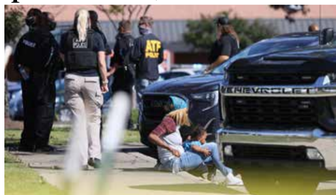
Emergency personnel respond to a shooting at a Kroger supermarket in suburban Memphis, Tennessee

"We found people hiding in freezers and in locked offices. They were doing what they had been trained to do - run, hide, fight," Lane told reporters, calling the gun violence "the most horrific event that has occurred