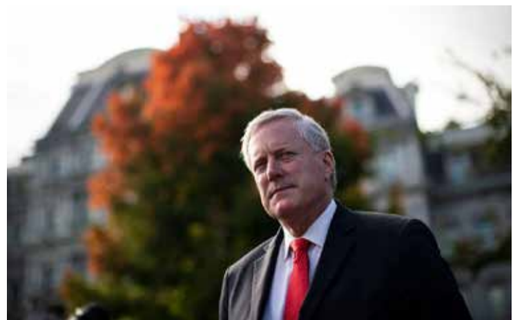
White House Chief of Staff Mark Meadows speaks to reporters following a television interview (file photo)

stormed the Capitol on Jan. 6 as Congress was meeting to certify Democrat Joe Biden's election victory, delaying that process for several hours as then-Vice President Mike Pence, members of Congress, staff and journalists fled from rioters.