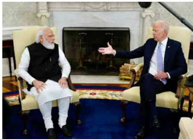
Prime Minister Narendra Modi in talks with US President Joe Biden

"Are we related?" U.S. President Joe Biden asked India's Prime Minister Narendra Modi when they met at the White House yesterday.