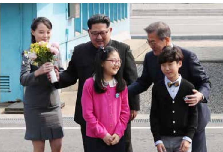
Kim Yo Jong (L), sister and close adviser to North Korea's leader Kim Jong Un (top C), brings a bouquet of flowers as he and South Korea's President Moon Jae-in (R) pose with children after meeting at Panmunjom in 2018 (file photo)

to declare end of Korean War is premature