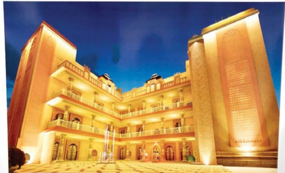
VIEW - 05