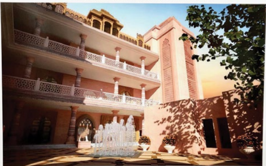
VIEW - 03