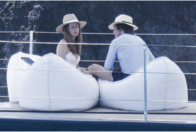
Ana de Armas and Tom Cruise on a boat in Spain