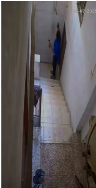
Footage of the incident

A court-appointed expert has been tasked with monitoring his progress and reporting back.