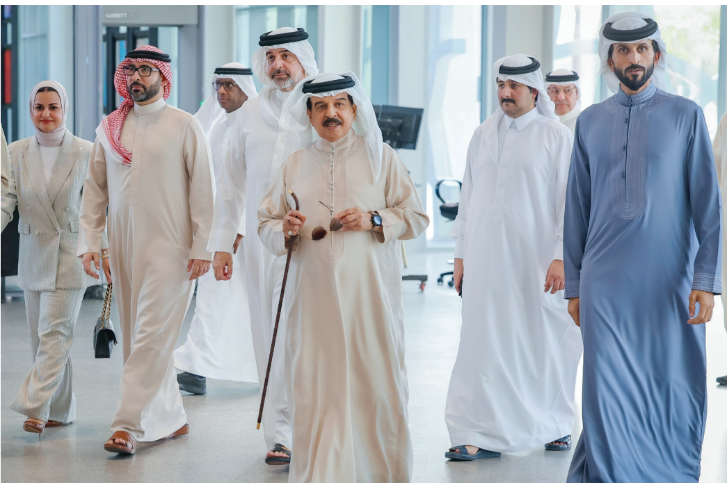
HM the King with senior officials during his visit

Accompanied by His Highness Shaikh Abdullah bin Hamad Al Khalifa, Personal Representative of His Majesty the King, HM King Hamad was received by senior officials including His Highness Shaikh Nasser bin Hamad Al Khalifa, Representative of HM the King for Humanitarian Work and Youth Affairs and Chairman of the Supreme Council for Youth and Sports; His Highness Shaikh Khalid bin Hamad Al Khalifa, First Deputy Chairman of the