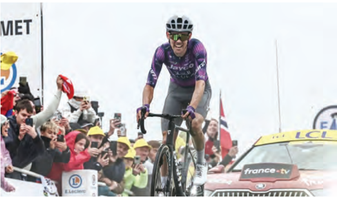
Team Jayco AlUla team's Australian rider Ben O'Connor cycles to the finish line

Pogacar tracked him and eventually dropped the Dane to gain another 11sec on the Team Visma rider who won the 2022 and 2023 Tour de France.