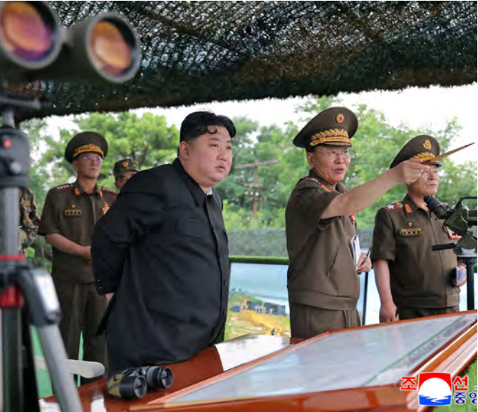
North Korean leader Kim Jong Un (C) observing a firing contest among artillery sub-units of large combined units of the Korean People’s Army