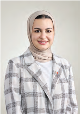
Minister of Youth Affairs- H.E Rawan bint Najeeb Tawfeeqi

The National Bank of Bahrain (NBB) has announced its collaboration with the Ministry of Youth Affairs as a major sponsor of the 14th edition of the “Youth City 2030” programme. The sponsorship is part of the Bank’s ongoing endeavours to support national youth empowerment projects by partnering with key government stakeholders. Organised by the Ministry of Youth Affairs with Tamkeen as the strategic partner, Youth City 2030 is one of the Kingdom’s leading summer training platforms that prepare young Bahrainis for future employment through diverse upskilling