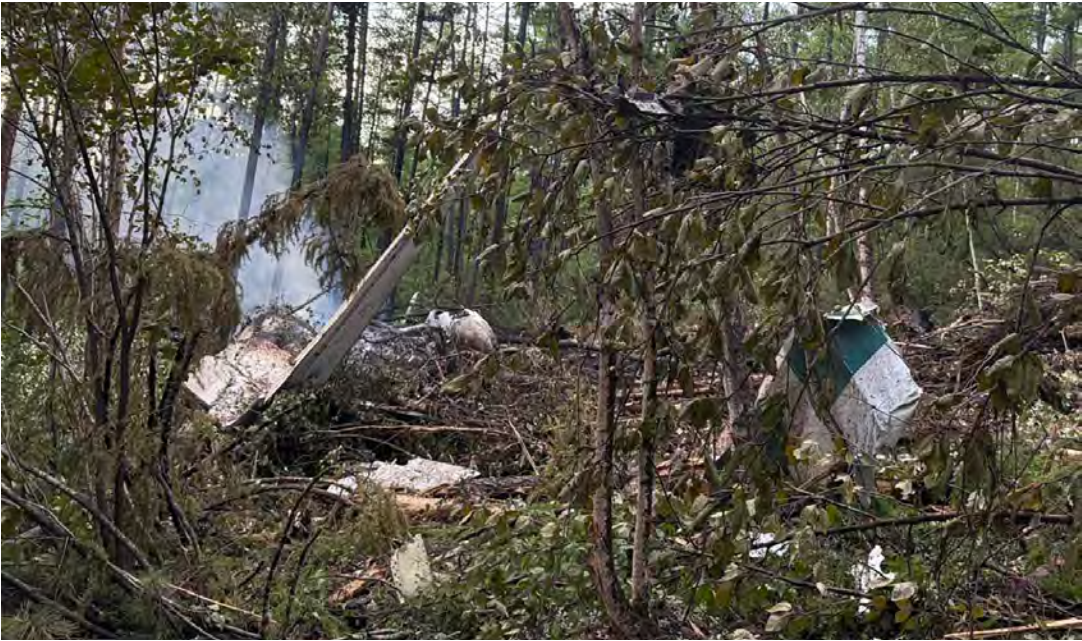
The crash site of the Antonov AN-24 passenger plane outside the town of Tynda in Russia’s far eastern Amur region

A passenger plane carrying nearly 50 people crashed in a remote area of Russia’s far eastern Amur region yesterday, killing all on board, authorities said. The plane, a Soviet-made twin-propeller Antonov-24, went down in remote, thickly forested terrain, leaving a column of smoke pouring from the crash site and no signs of survivors, according to state media and videos published by investigators. The Angara Airlines flight was headed to the town of Tynda from the city of Blagoveshchensk when it disappeared from radar at around 1:00 pm local time (0400 GMT). A rescue helicopter later spotted the burning fuselage of the plane on a forested mountain slope about 15 kilometres (nine miles) south of Tynda’s airport. Videos published by Russian investigators showed smoke rising from the crash site and what appeared to be fragments of the