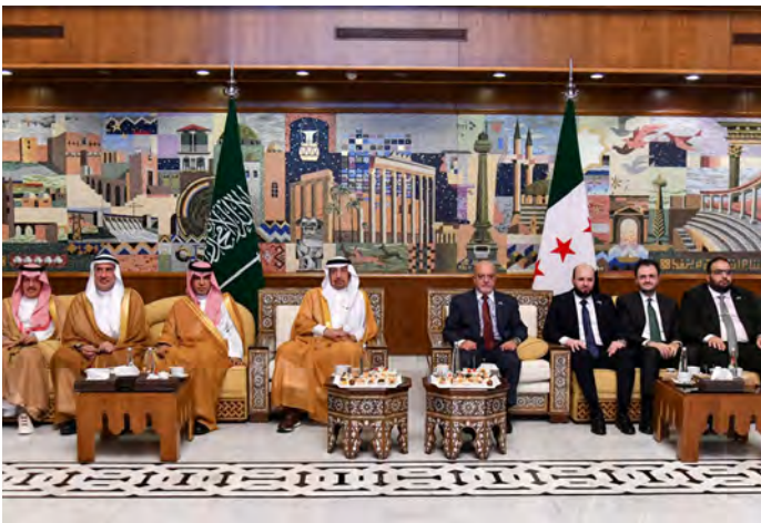
Saudi Arabia’s Investment Minister Khalid bin Abdulaziz al-Falih (C-L) and his delegation being received at Damascus International Airport

With interim President Ahmed al-Sharaa and other officials in attendance, Syrian economy minister Mohammed al-Shaar called the forum “a historic milestone in the history of relations between our two