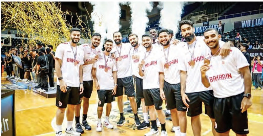
Bahrain's national team presenting their bronze medals from Taiwan

Fresh off a bronze medal in Taiwan, Bahrain's basketball stars return home hungry for the Arab Championship