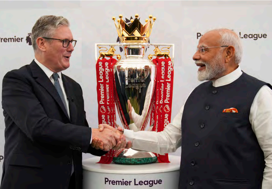
Britain’s Prime Minister Keir Starmer (L) and India’s Prime Minister Narendra Modi look at a Premier League trophy during a business showcase event at Chequers, in Aylesbury

Prime Minister Keir Starmer praised Britain’s “unique bonds” with India as he and his Indian counterpart Narendra Modi formally signed a recently announced UK-India trade deal during talks yesterday. Starmer hailed the agreement as a “landmark moment” for both countries as he hosted India’s leader at his Chequers country estate, northwest of London. “This is not the extent or the limit of our collaboration with India,” added the British premier, whose year-old government is struggling to fire up an economy weakened by years of stagnant growth and high inflation. “We have unique bonds of history, of family and of culture and we want to strengthen our relationship further, so that it is even more ambitious, modern and focused on the long term,” he said. Starmer and Modi announced in May they had struck a free trade agreement that the British government says will eventually add £4.8 billion ($6.5 billion) a year to the UK economy.