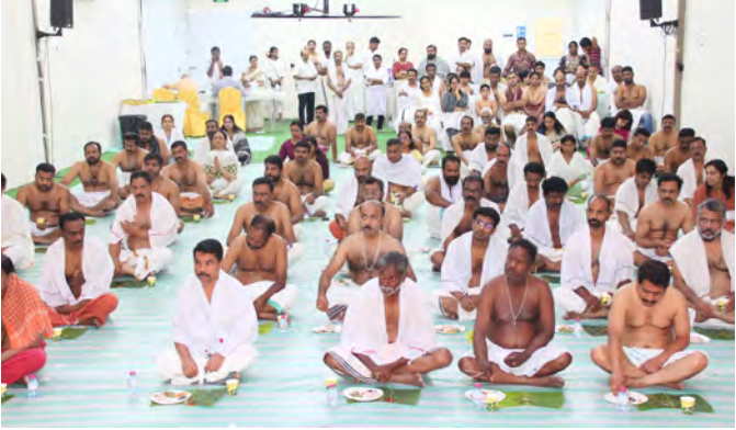
Participants in the sacred offering and rituals