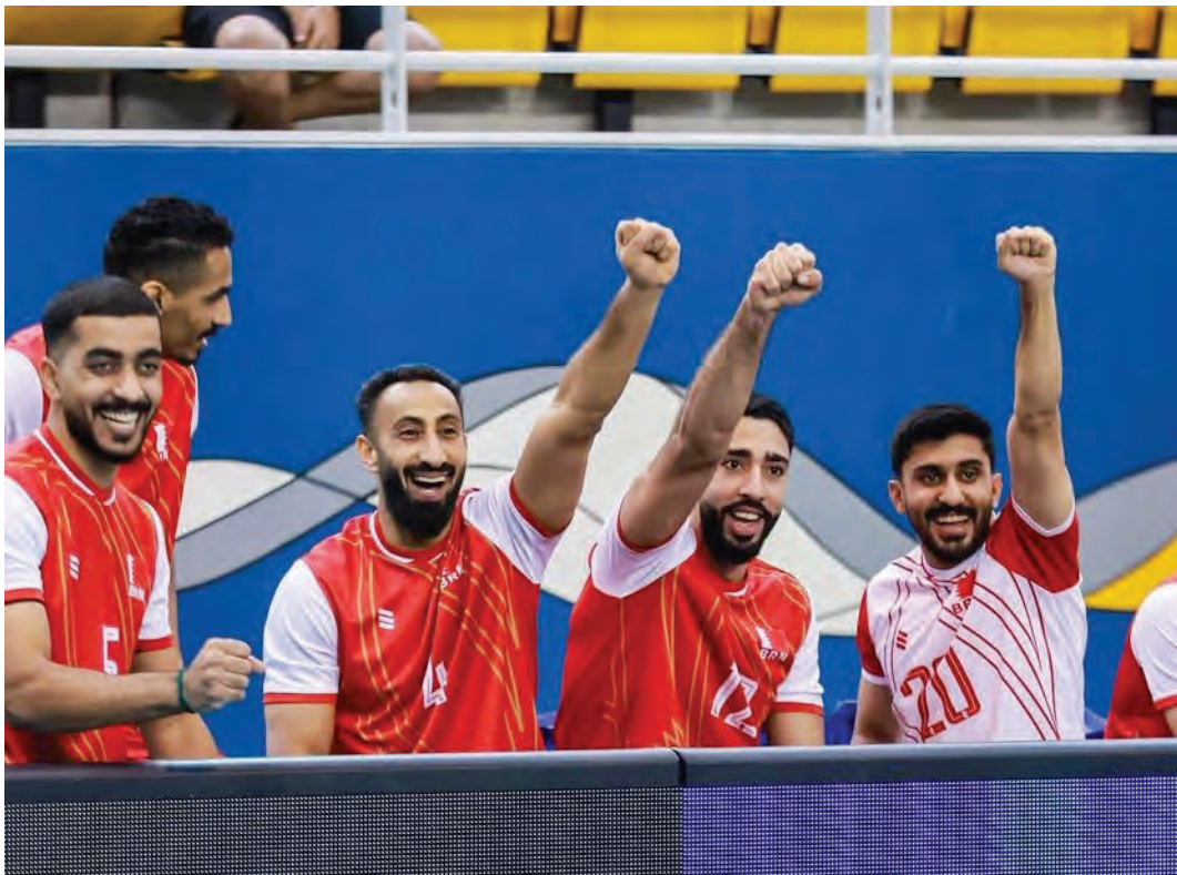
Bahrain's players in high spirits after the win

No team has looked more in control than Bahrain. The hosts have marched into the semi-finals without losing a single set – sweeping Jordan, Lebanon, and the UAE in pool play before dismantling Kuwait 3-0 (25-15, 25-22, 25-20) in the quarters. Their serving has been ruthless (a tournament-best 22 serve points heading into knockouts), and their depth shows in every rotation.