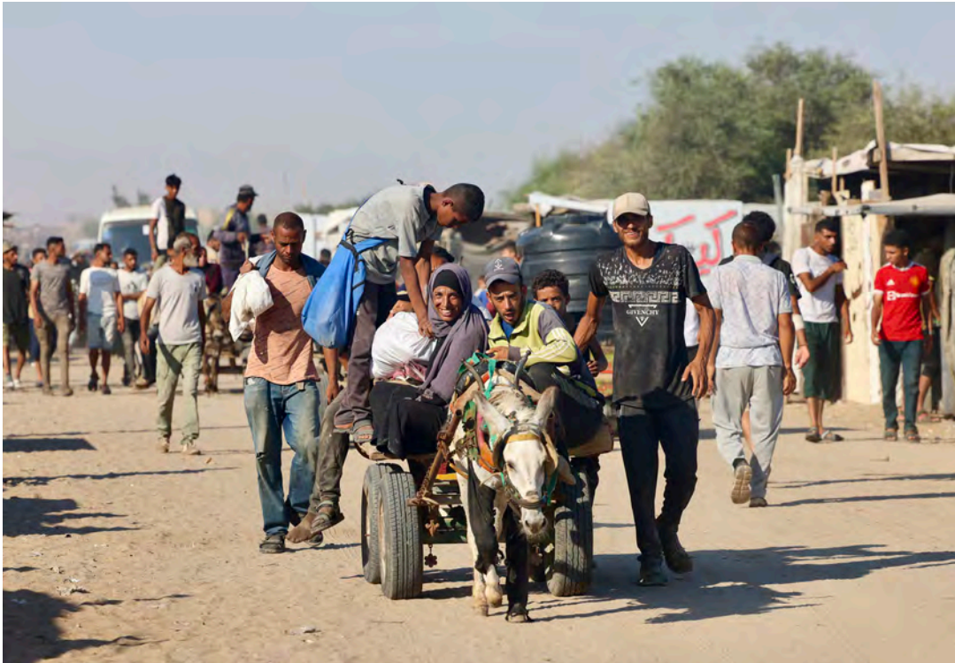
Palestinians make their way in the Mawasi area of Rafah after receiving humanitarian aid from an aid distribution point in the southern Gaza Strip

“We appreciate the efforts of mediators Qatar and Egypt and the efforts of (US special) envoy (Steve) Witkoff to bring about a breakthrough,” said a statement from Netanyahu’s office.