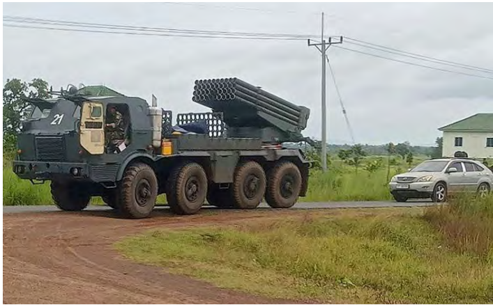
A Cambodian BM-21 rocket launcher returns from the Cambodia-Thai border