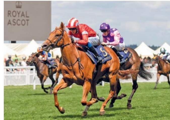
HH Shaikh Nasser bin Hamad Al Khalifa's horse, Daahyeh, during the race