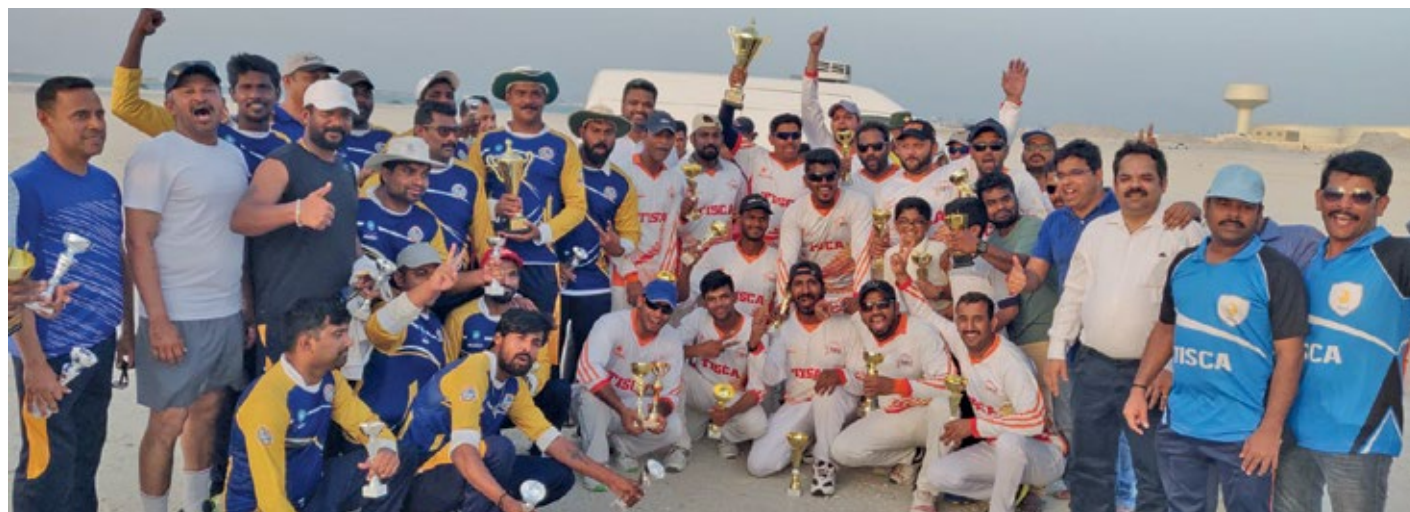
TISCA stars with the CBA Division D 25 overs trophy after defeating NDC Bahrain in the final.