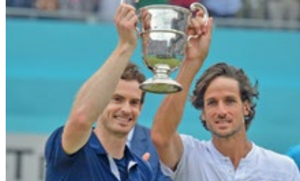
Andy Murray celebrates after winning Queen's doubles title alongside partner Feliciano Lopez

Murray said that while he had not made up his mind about a return to singles, the US Open would be the tournament where it could happen.