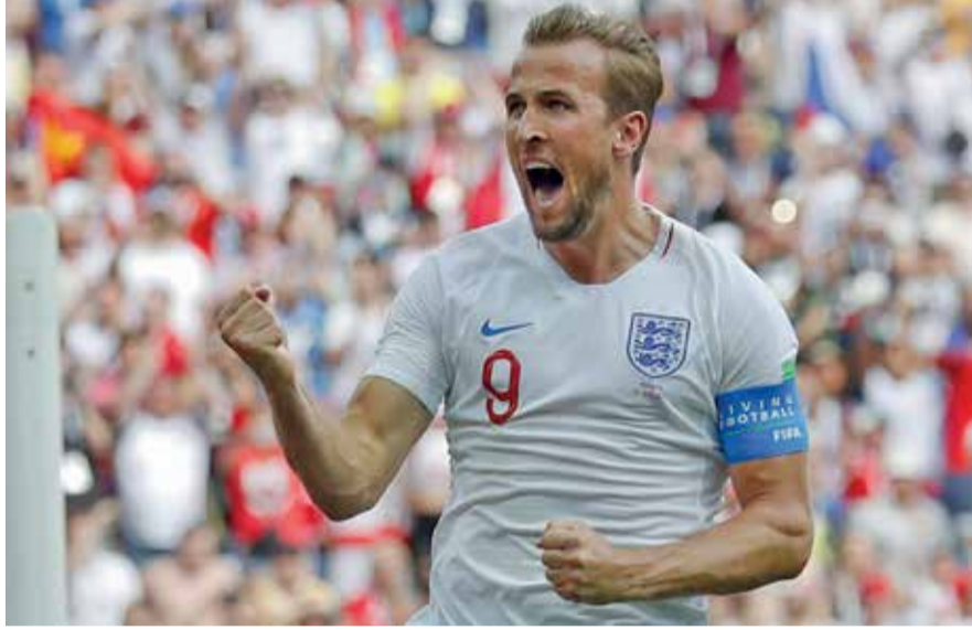
Kane celebrates his third goal of the tournament

Things failed to improve but then-coach Roy Hodgson kept faith with the