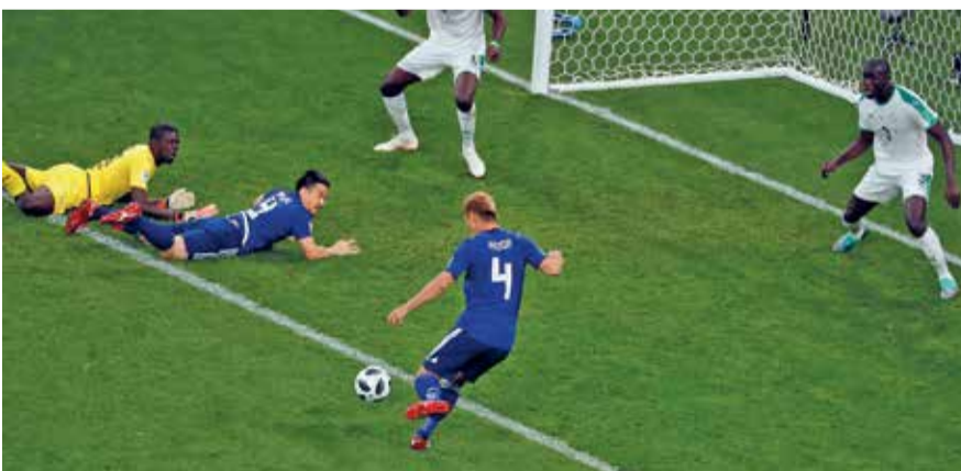
Honda score Japan's second equaliser

Eiji Kawashima and the goalkeeper made a mess of it, punching the ball into the lurking Liverpool star Sadio Mane.