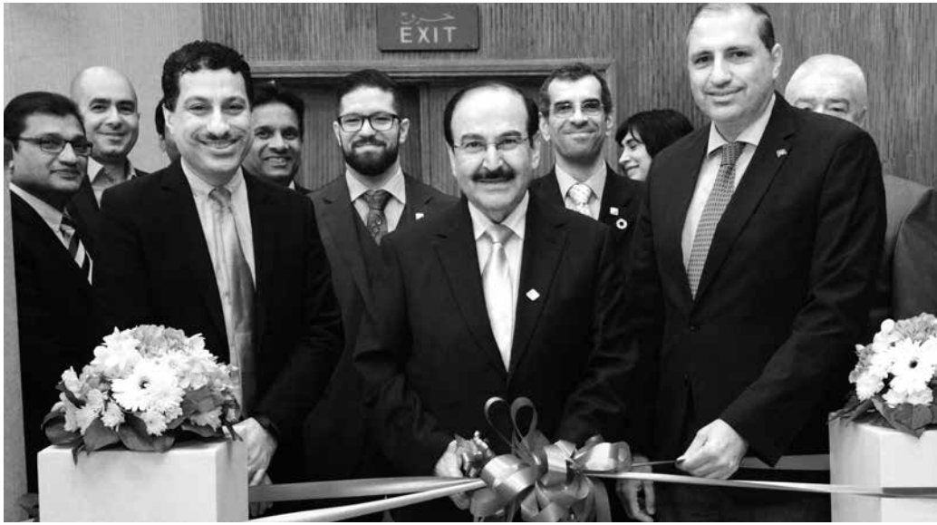
Electricity and Water Affairs Minister Dr. Abdulhussain Mirza inaugurating the seminar

Minister Dr. Abdulhussain Mirza inaugurated the training session organised for contractors and consultants