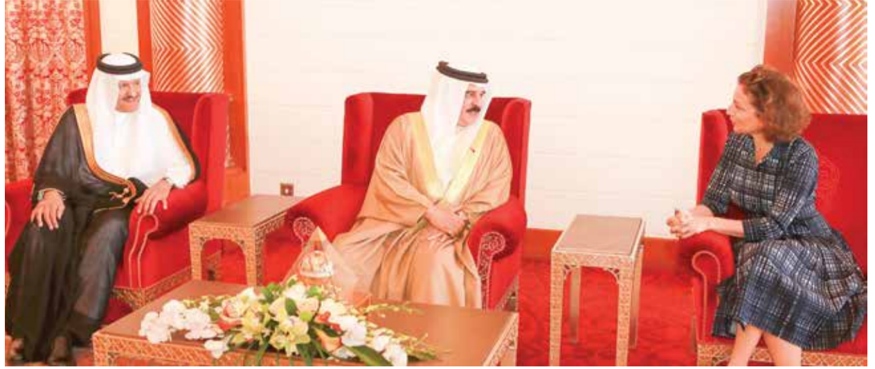
His Majesty receives Prince Sultan bin Salman bin Abdulaziz Al Saud and Audrey Azoulay.

His Majesty highlights Bahrain's standing on world cultural map