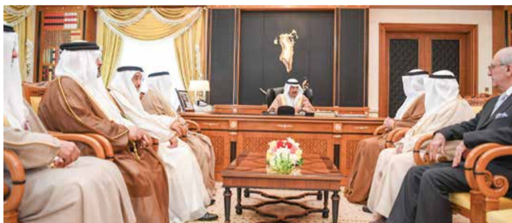
His Royal Highness Prime Minister Prince Khalifa bin Salman Al Khalifa yesterday received the heads of Representatives and Shura councils at Gudaibiya Palace. HRH the Premier reviewed the implementation of royal directives to rethink pension plan draft. In conformity with the royal directives, a government-parliamentary committee has been formed to develop new visions that ensure maintaining the pension funds and citizens' rights.

HM the King and the guests taking part in the 42nd session then watched a show of pure Bahraini Arabian breed horses which top the races. Bahrain, which is registered in the World Arabian Horse Organisation, boasts some of the finest and purest Arabian breed.