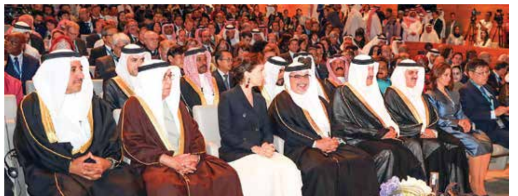
On behalf of His Majesty King Hamad, His Royal Highness Prince Salman bin Hamad Al Khalifa, the Crown Prince, Deputy Supreme Commander and First Deputy Prime Minister, yesterday attended the inauguration of the 42nd meeting of the United Nations Educational, Scientific and Cultural Organization's (UNESCO) World Heritage Committee, held at Bahrain National Museum. HRH the Crown Prince affirmed that the opportunity to host the 42nd edition of this event reflects an important milestone in the Kingdom's efforts to promote its long-standing historical and cultural identity underpinned by HM the King's continuous support.