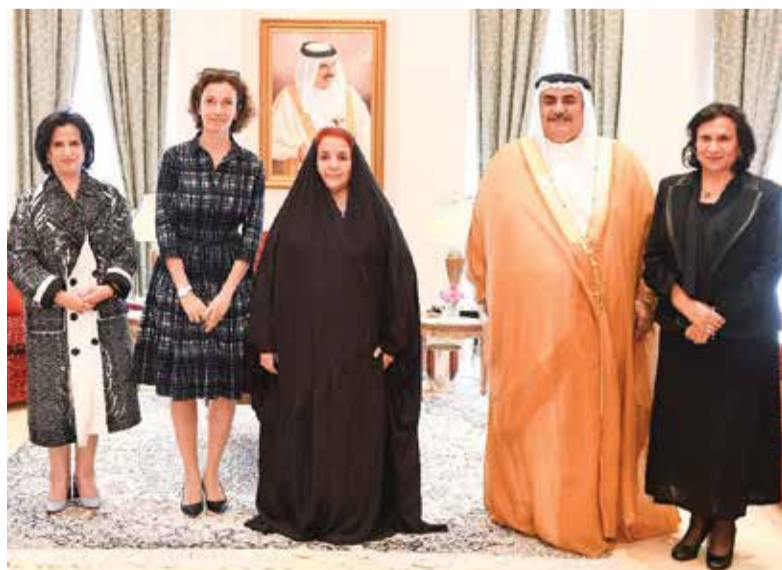
Her Royal Highness Princess Sabeeka bint Ibrahim Al Khalifa, Wife of HM the King and President of the Supreme Council for Women (SCW) yesterday received the Director-General of the United Nations Educational, Scientific and Cultural Organisation (UNESCO), Audrey Azoulay. HRH Princess Sabeeka stressed the importance of UNESCO's efforts to create suitable conditions for enhancing dialogue among civilisations, cultures and peoples on bases of respect for common values to achieve the global visions for sustainable development.