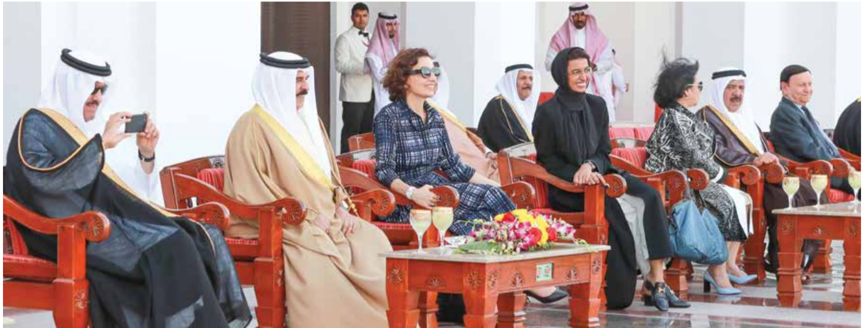
His Majesty along with guests watch special horse show.

Bahrain is chairing the 42nd session, being held under the auspices of HM the King and in the presence of 2,000