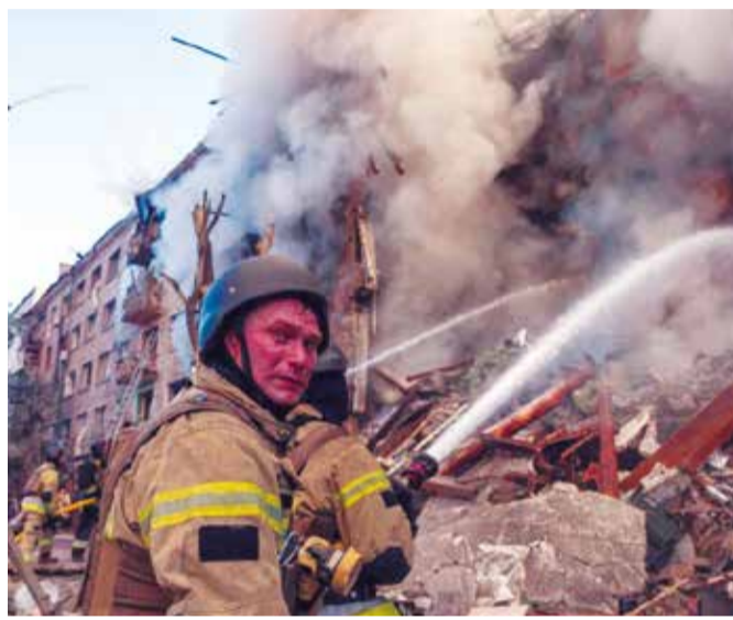
Firefighters work to extinguish a fire at the site of a heavily damaged building following Russian strikes to the Ukrainian capital in Kyiv

territory, the Armed Forces of the Russian Federation carried out a massive strike using Oreshnik ballistic missiles, Iskander air-launched ballistic missiles, Kinzhal hypersonic air-launched ballistic missiles and Tsirkon cruise missiles," as well as in a statement.