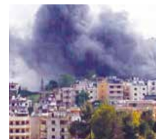
Smoke rises from the site of an Israeli strike that targeted the Nabatieh village in southern Lebanon