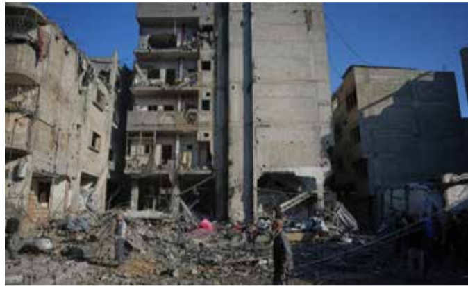
Residents inspect the rubble of a building that belongs to the Palestinian family of Abu Saif and was destroyed by an Israeli airstrike in Nuseirat, central Gaza Strip

AFP | Gaza City, Palestinian Territories