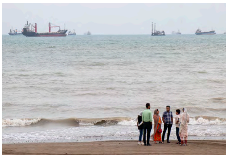
Iranians are seen at Suru Beach in Bandar Abbas along the Strait of Hormuz

Oil prices slid yesterday amid hopes that any fresh peace talks would see an end to disruptions to trade through Hormuz and the US blockade of shipping to and from Iranian ports.