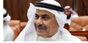
Hassan Eid BuKhammas, Chairman of Parliament's Foreign Affairs, Defence and National Security Committee

Human Rights has backed the proposal, saying it is in line with the Constitution and international standards.