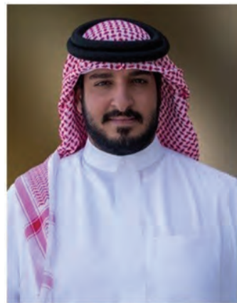
His Highness Shaikh Isa bin Abdullah bin Isa Al Khalifa, President of Bahrain Royal Equestrian And Endurance Federation