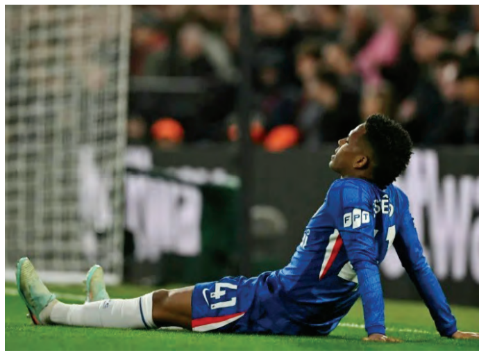
Chelsea's Brazilian midfielder #41 Estevao reacts after picking up an injury

play for us (again) this season," he said. "He's going to be out for a little bit of time.