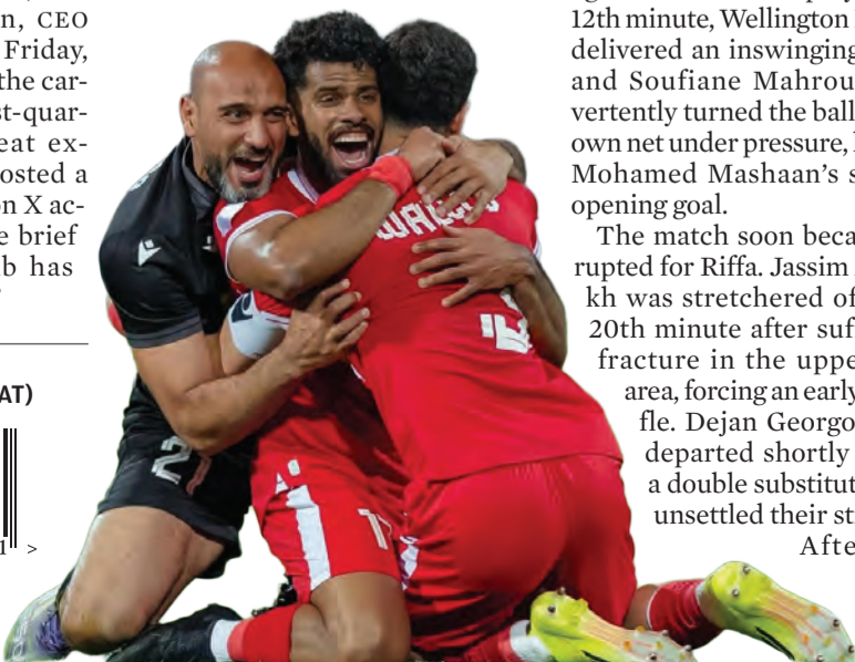
Emotional celebrations at full-time