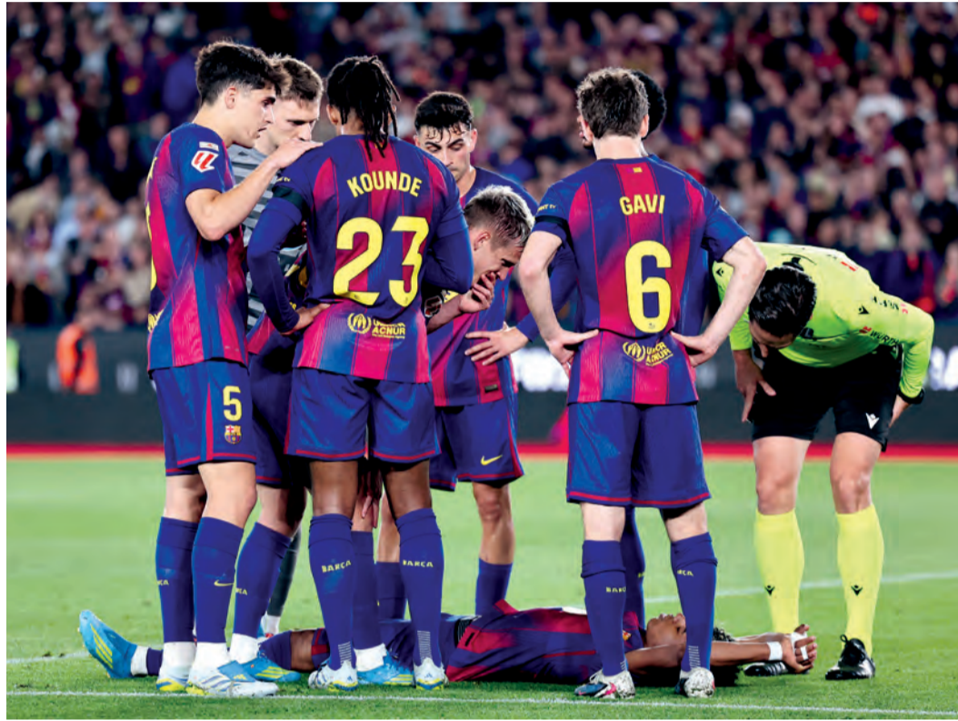
Spanish referee Jose Luis Munuera (R) and teammates check on Barcelona's Spanish forward #10 Lamine Yamal

However, the stricken Yamal has been a decisive figure for his team this season, with 24 goals