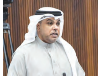
Mohammed Al Rifaie, MP

The authority also confirmed plans for large-scale solar developments across the kingdom, including the expansion of the