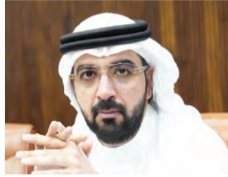
Hassan Ebrahim, MP

clude public awareness campaigns and ongoing solar energy projects.