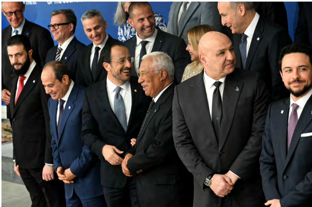
Italy's Prime Minister Giorgia Meloni (4R) shares a laugh with Cyprus' President Nikos Christodoulides (C) and European Council President Antonio Costa (front, 3R) as they wait for France's President Emmanuel Macron for a family photo

"The current situation clearly underscores how closely Europe's security is linked with that of the Middle East, and how vital our cooperation on security and defence has become," European Council president Antonio Costa told a press conference after the talks.