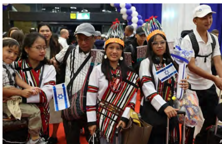
Members of the Bnei Menashe (Sons of Manasseh) community in India arrive at Ben Gurion Airport in Lod, near Tel Aviv

Their oral history tells of a centuries-long exodus through Persia, Afghanistan, Tibet and China, all the while adhering to certain Jewish religious practices, like circumcision.