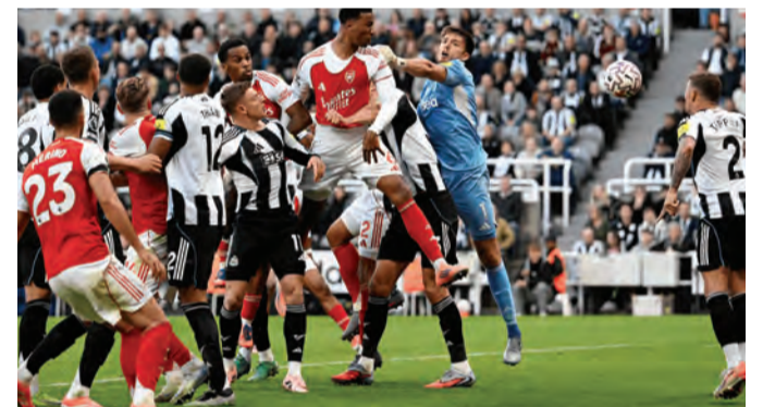
Action from the reverse fixture, when Arsenal secured victory