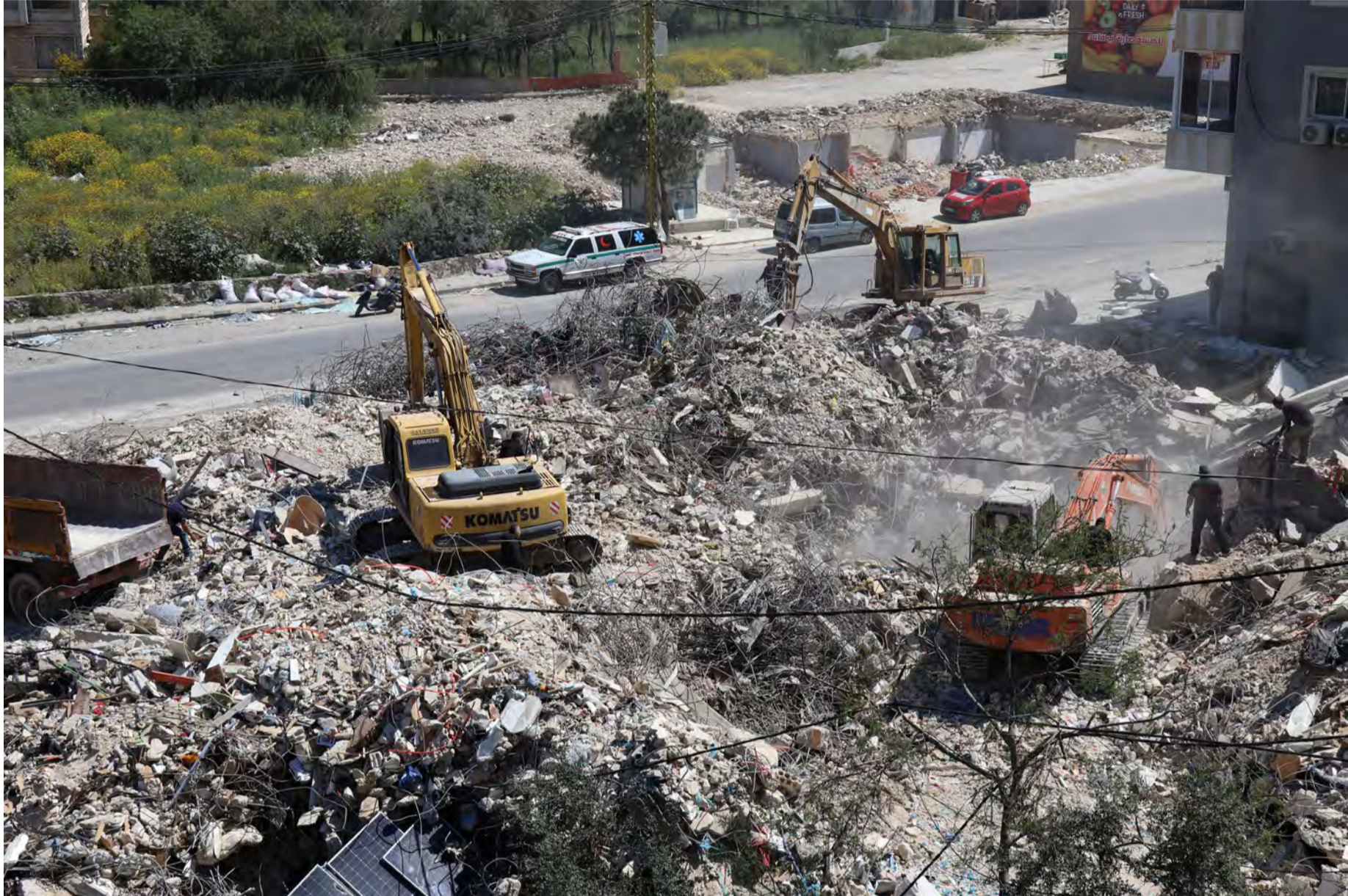
Rescue teams work to remove rubble from a building previously hit by the Israeli army, in the southern Lebanese village of Hanaouay

The invitation would mark a major easing of international pressure on Putin, who has been shunned by most of the West but not Trump since ordering the 2022 invasion of Ukraine.