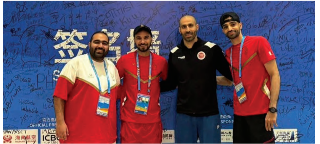
Bahrain's team upon arrival in China