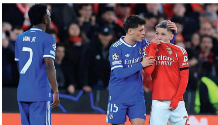
The incident in question during the match

UEFA's disciplinary ruling includes a six-game ban, with