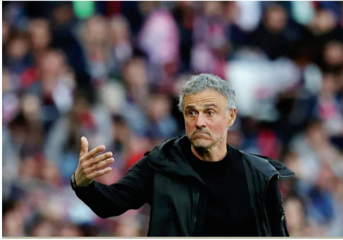
Paris Saint-Germain coach Luis Enrique reacts during a match (file photo)